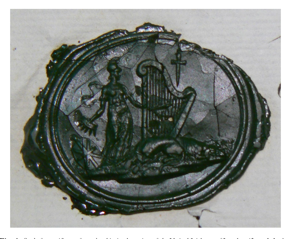
Fig. 1: Seal of a certificate of membership in the society of the United Irishmen of London, (found during the arrests of 18 and 19 April 1798, NA PC 1/44/158)

potent symbol of revolution and insurrection: the new seal of the United Irishmen which serves as a passport to the French Directory: «the seal is a long oval Device, Britannia stealing the Crown from the Harp & cutting the strings whilst the Irish Mastiffs are sleeping»<sup>208</sup>. This description omits the revolutionary and republican dagger, which shows that the alliance between Britannia and the harp of Erin was to lead to the destitution of royalty (the crown) through the republican conspiracy