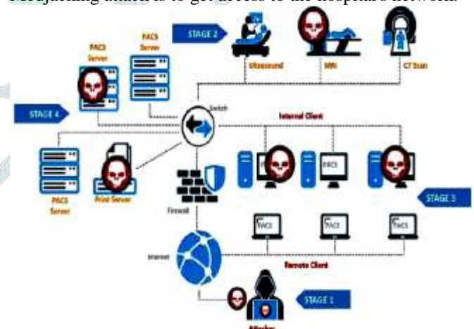
Fig. 4 The Medjacking Attacks in MIIoT

Hacker gains access to a system via a backdoor constructed by hijacking a medical device in the Medjacking attack vector. Because of the rising targeting of healthcare systems, a new term for these cyber-attacks has been coined medjacking in figure 4. However, medjacking can be used for more than just gaining access to a patient's medical records. Vulnerabilities in medical devices may endanger patients' health, if not their lives. The attackers can utilize the backdoor to steal patient data, send ransomware, or shut down systems once it has been setup. The goal of every Medjacking attack is to get access to the hospital's network.