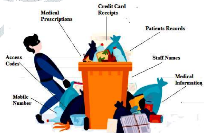
Fig. 3 The Dumpster Diving Attacks in MIIoT

The process of exploring trash for useful information about a person and medical information that can later be used for the hacking purpose indicated in figure 3 is known as dumpster diving. This assault primarily targets large healthcare organisations or businesses, with the goal of phishing (mainly) by sending victims phoney emails that look to come from a legitimate source. During this attack, any medical information, including patient records, medical prescriptions, staff names, and other papers and files tossed in the garbage, is retrieved.