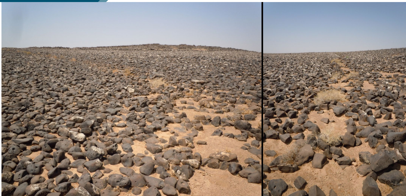
Fig. 6. Probable ancient 'stepped' pathway found during surveys

showed that while some of the sites contain material of the Chalcolithic/Early Bronze Age, the majority were at least first occupied during the Late Neolithic (Imad Alhussain, pers. comm.). These conclusions are currently being synthesized with the ongoing OSL dating of sediment samples that were taken at five different sites using a process recently successfully employed at Wisad Pools (Athanasas et al. 2015). By collecting from both "wheels" and "encircled enclosure clusters", any clear difference in dates between the two site types should be identifiable, tying into one of this project's main goals of enabling rapid dating of sites across the wider region by remote sensing.