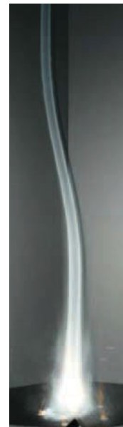
Fig. 2. “Tornadoe apprivoisée” a 3m high open tornado simulator.

When mediation of scientific ideas is targeting a non-scientific public, the aesthetic may be pushed by adding complexity to the demonstration in order to trigger questioning and not only to give easy answers. For “The Tornado Tamed” demonstrator (Fig. 2), by adding hot colour lights and irregular injections of smoke, the tornado seems to form instantly when smoke is emitted and illuminates the core of the vortex, and to disorganize when smoke reaches the periphery, giving the illusion of an aesthetic life cycle that puzzles observers