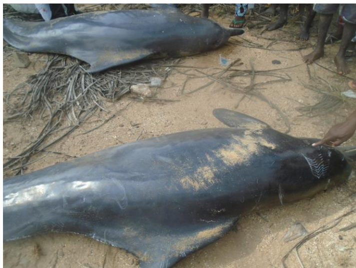
Figure 5.— Two Atlantic humpback dolphins dead after entanglement in a beach seine at Agbodrafo, 14-VIII-2016.

Folk knowledge. — While traditional animist beliefs prevalent in Togo regard dolphins protected 'totems' (Segniabeto et al. , 2014), evidently these cannot prevent accidental