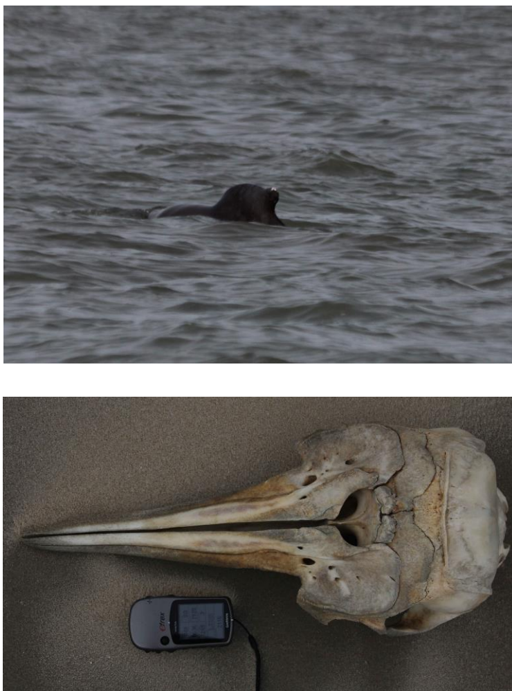
Figure 2.— (A, upper) Adult member of a group of ca. 40 dolphins sighted off Katfoura Island, Tristao, on 07.VI.2012, represents the earliest photographic record of live S. teuszii in Guinean waters. (B, lower) Calvaria of a juvenile S. teuszii collected at Katfoura Island, Tristao, from a reported by-catch (see text). (Photos: K. Van Waerebeek).

approached (e.g. Van Waerebeek et al. , 2004; Ayissi et al. , 2014). Mean Lower Low Water depth ranged 1-3 m. With high tide at 10:58 and a 5 m mean tidal range, water depth at both locations was estimated as 4.75-6.75 m. Turbidity was high. Multidirectional movements in subgroups of 2-4 individuals with frequent, abrupt speed changes pointed to active foraging in the rising tide, observed also in Senegal's Saloum Delta (Van Waerebeek et al. , 2003, 2004). The strong ontogenetic (and possibly sexual) variation in the shape and size of dorsal humps and fins, pointed to a mixed-age group with adults, juveniles and a single calf. The largest individuals showed massive, rectangular dorsal humps (Fig. 2A). In Oct-Nov 2013, Weir (2015) reported five sightings, a minimum of 47 animals, around the Río Nuñez Estuary, SE of the Tristao Islands.