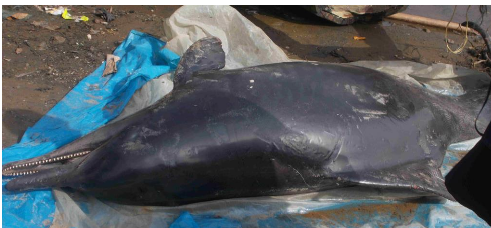
Figure 6.— Atlantic humpback dolphins captured in artisanal coastal fisheries. (A, top) Juvenile landed at Imbikiri quarters, Brass Island, Nigeria, February 2012; (B, middle) Adult specimen at Rotel fishing settlement, Nigeria, in November 2011. (Photos: Michael Uwagbae). (C, bottom) Freshly captured specimen at Londji landing site, Cameroon. (Photo: Isidore Ayissi).