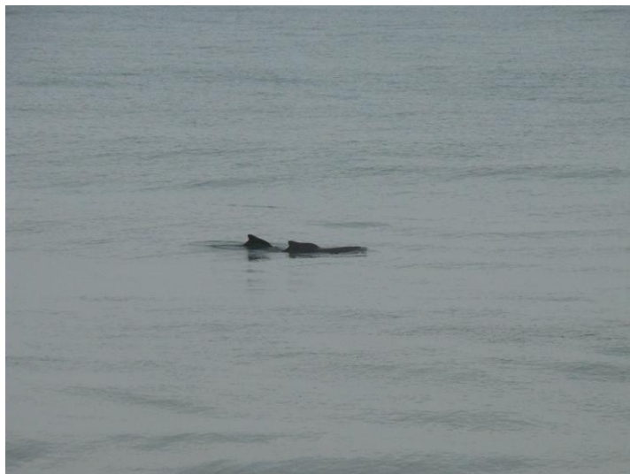
Figure 4.— A small group of Atlantic humpback dolphins observed from the beach at Goumou-Kopé, eastern coast of Togo, on 25-III-2015. (Photo, © Loïc Henry, OFFAP Togo, Observatoire de la Faune, de la Flore et des Aires Protégées du Togo. Reproduced with permission).

Agbodrafo (N06°12.00',E01°28.73') at the eastern coast, on 14 August 2016, the first S. teuszii specimen records for Togo (Fig. 5). One of us (GS) seized and buried the carcasses for later retrieval of skeletons.