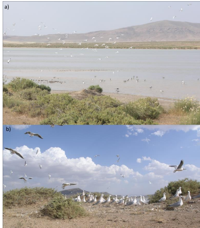
Figure 5.— (a, upper) View of Guelif, a salt lake in the Oum El Bouaghi wetland complex, Haut Plateaux. (b, lower) Colony of Slender-billed Gull attending nests at Guelif in 2005.

This study: (EN): Salines, Lac Oubeïra, Lac Mellah, O. Seybouse, Mafragh, Sidi Salem, (WN): Fetzara, (EHP): Guelif (Fig. 5a,b), Ezzemoul, Jemott, Tinsilt, TazougartII, Timerganine, Boulehilet, Ank Djmel, Lac T lamine, Garaet Bougtob (Fig. 6a), Oued Rhiou.