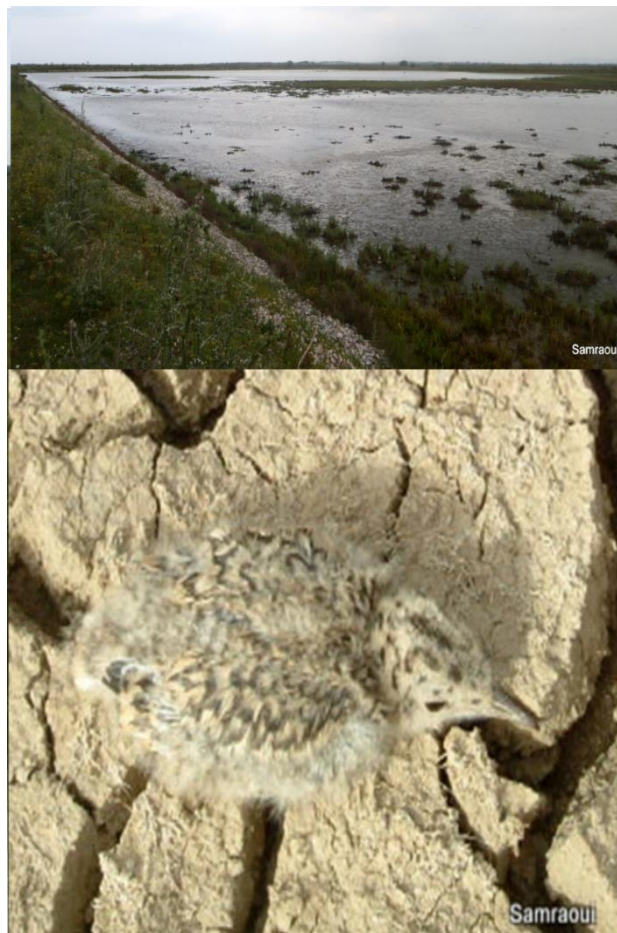
Figure 4.— (a, upper) View of Salines, a disused salina near Annaba. (b, lower) A Little Tern chick at Salines.