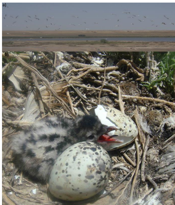
Figure 6.— (a, upper) View of the salt lake of Bougtob. (b, lower) Nest of Slender-billed Gull at Bougtob with newly hatched chick and egg.

The first hatching occurred in the last decade of May. Clutch size varied from 1 to 3 (Fig. 3) with mean clutch size averaging 2.71 \pm 0.56 ( N = 21 clutches). The recorded mean clutch size at Guelif is similar to the one (2.8 eggs/nest) found at Dayet El Kerfa (Cherief-Boutera et al. , 2013) and is marginally higher to the one recorded in Tunisia (2.5 eggs/nest; Chokri & Selmi, 2012) (One Sample t-test: t = 1.75 , df = 20 , p = 0.10 ). However, the mean clutches recorded in Algeria are significantly higher to the one recorded in Mauritania (2.29 eggs/nest; Campredon, 1987) (One Sample t-test: t = 3.5 , df = 20 , p = 0.002 ).