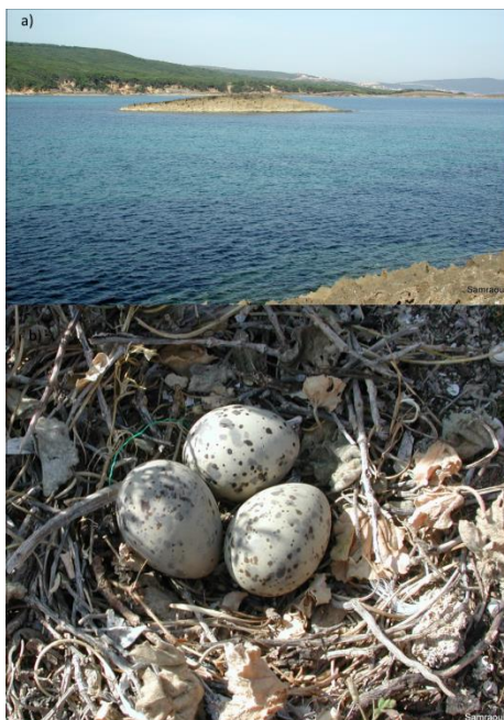
Figure 2.— (a, upper) View of islet, a breeding site of Common Tern, offshore of the Plage des Goélands near El Kala. (b, lower) Nest with eggs of Common Tern.

Previous known colony: “Islet near El Kala” (Michelot & Laurent, 1992; 1993).