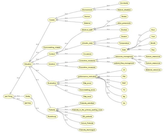
Figure 2– EDOMO ontology structure

data properties, 687 axioms, 546 logical axioms, and 251 concept instances for the 100 overcrowding situations. Each object property and each data property has an instance for every situation case.