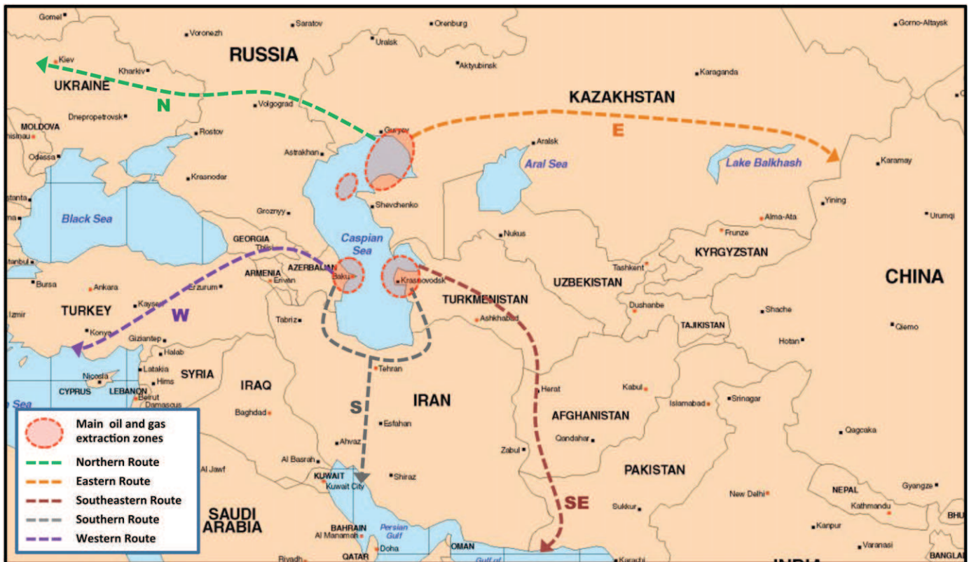
Fig. 2. Alternative transportation routes and the main oil and gas extraction zones.

Three independent pipelines have been proposed to pass through Georgia: the Baku–Supsa and Baku–Ceyhan crude oil pipelines and the Southern Caucasus natural gas pipeline from Baku to Tbilisi and Erzerum, and in 2005, the Baku–Tbilisi–Ceyhan pipeline became operational (Shaffer, 2010). While the US consistently has supported the principle of multiple export