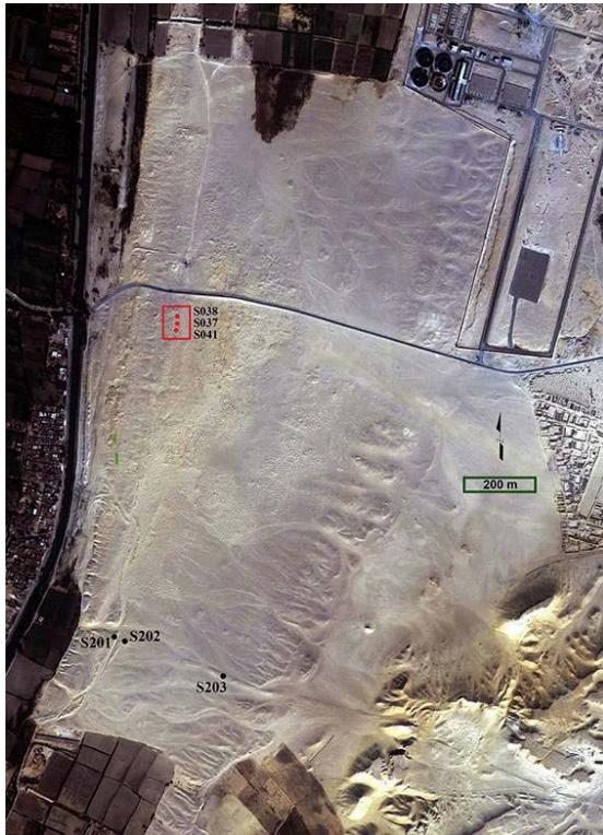
Fig. 2. Location of the sectors investigated during the third excavation season at Philadelphia (S37, S38, S41 and S201-203). Based on satellite images from 7/11/2010, DigitalGlobe© / ORION-ME©, GoogleEarth©, with modifications by R.-L. Chang and Mohamed Gaber.