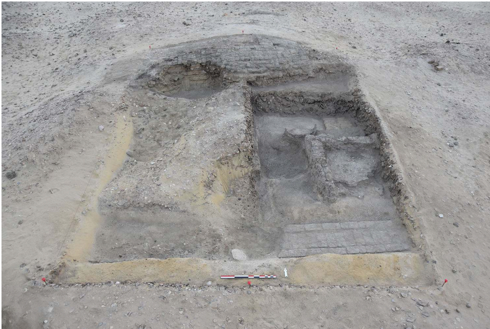
Fig. 6. S38 (PhF1903), viewed from the south.