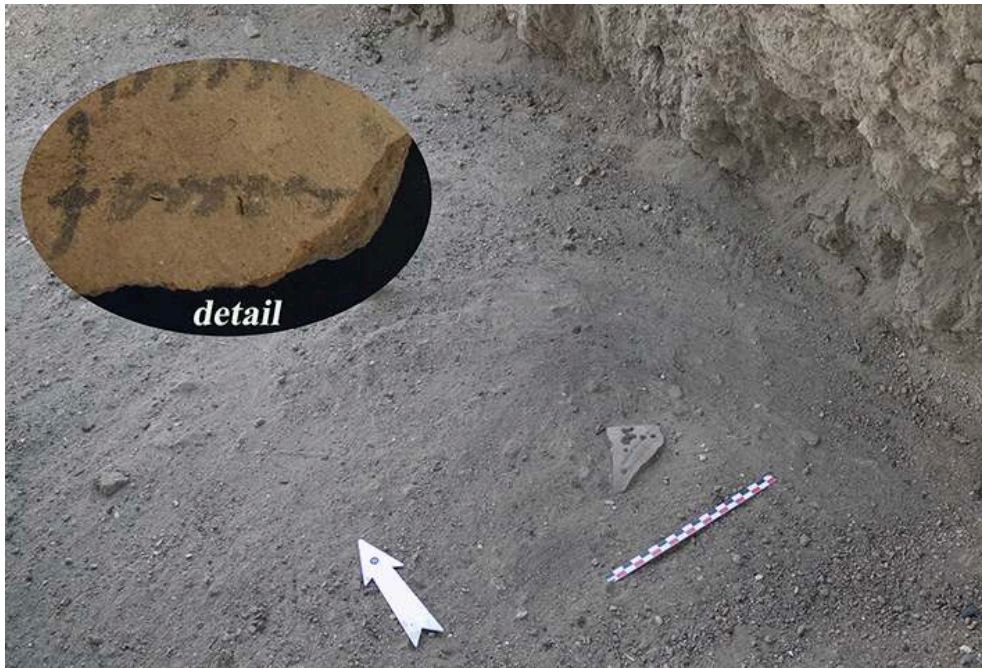
Fig. 9. S38 (PhF1903), discovery of a Greek ostracon.