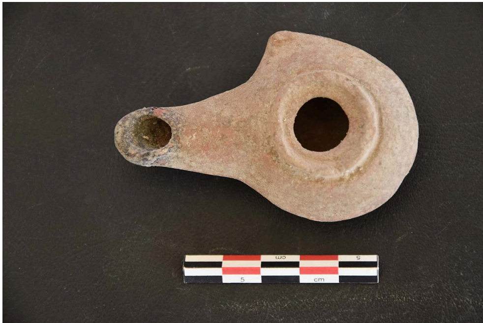
Fig. 10. S38 (PhF1903), a terracotta lamp.