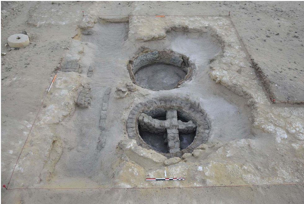
Fig. 3. S41 (PhF1903), two pottery kilns, viewed from the south.