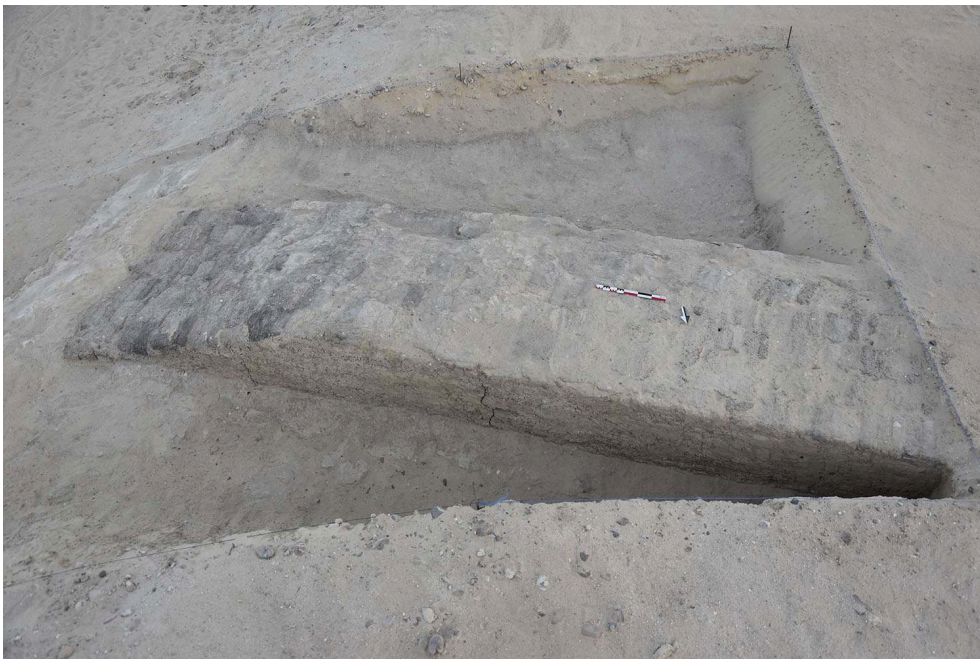
Fig. 7. S201 (PhF1903), a section of the long wall, viewed from the north.