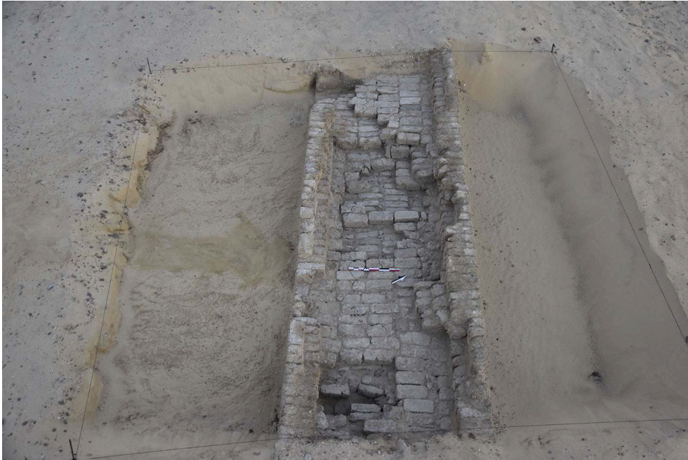
Fig. 8. S203 (PhF1903), a section of the long wall, viewed from the east.