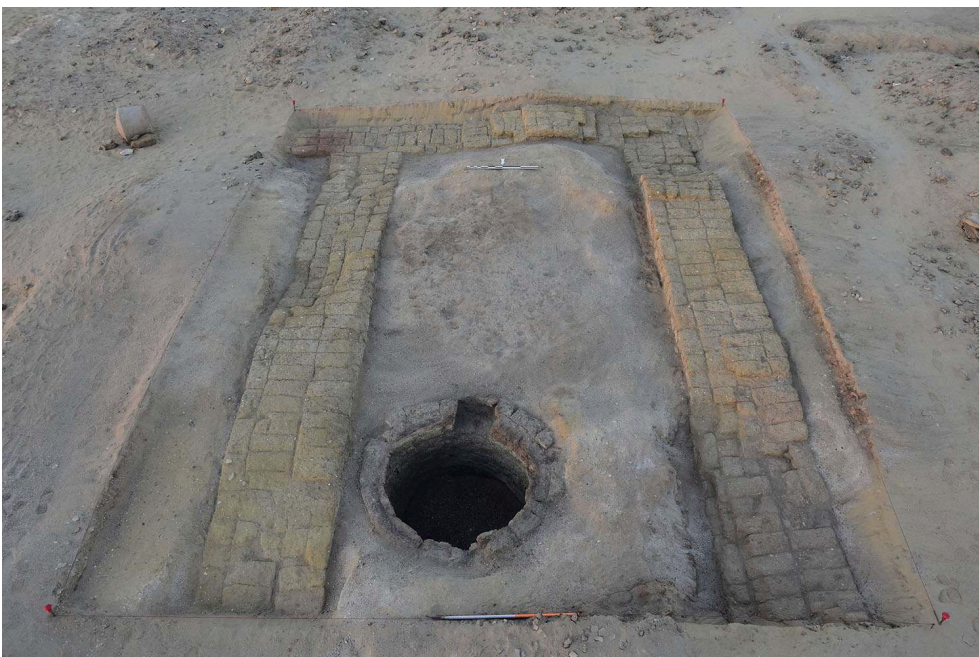
Fig. 5. S37 (PhF1903), a pottery kiln enclosed by foundation trenches, viewed from the north.