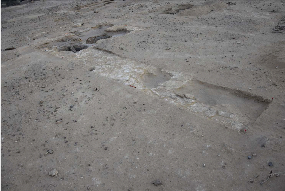
Fig. 4. S41 (PhF1903), eastward extension, viewed from the south-east.