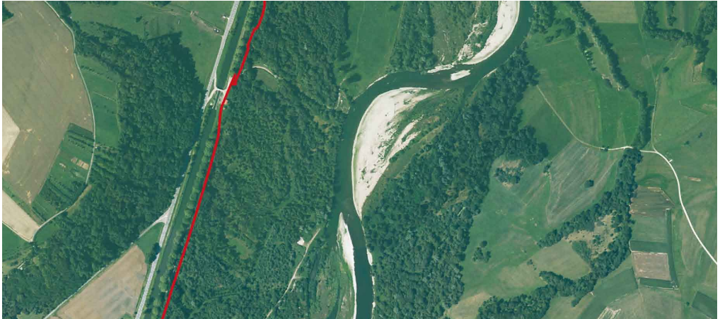
Figure 3. — The landscape along the active channels of the upper Moselle valley (near Bainville-aux-miroirs) in 2004. (IGN 2004). In red, limits of Natura 2000 area.