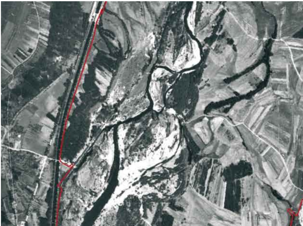
Figure 2. — Landscape along the active channels of the upper Moselle valley (near Bainville-aux-miroirs) in 1949 (IGN 1949). In red, limits of Natura 2000 area.

In the Moselle valley, the number of patches per forest community or per mosaic of two forest communities as well as their respective surface areas and perimeters, were quantified using the aerial photographs from 2004.