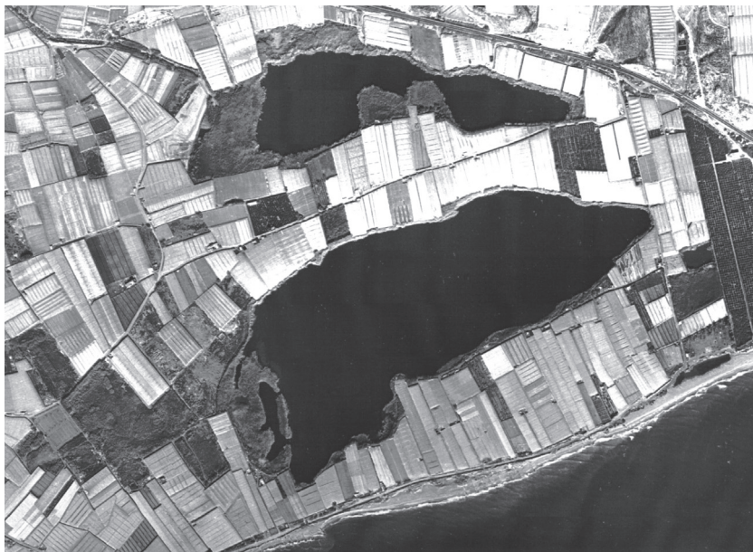
Figure 1. – Aerial photographs of the Albuferas of Adra in 1957 (top) and 1992 (bottom) showing the central open water (darker) and the peripheral belts of reed-bed (greyish) habitats of the lagoons surrounded by dunes and sands in 1957 and evergreens in 1992.

composition of the wetland throughout the study period, the time from the middle of the first stage (1959.5) to the successive ones (1974.5, 1982, 1987, 1992, 1997, and 2002) were used. To discriminate the relationships between morphological features and bird-species richness of the wetland, each photo was related to a corresponding stage. The average value for each landscape variable from the photos of 1957 and 1962 was used for the stage 1950-1969 to a complete matching between the data of landscape and bird variables.