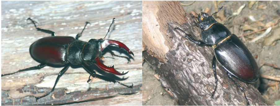
Figure 1. — The male stag beetle (left) is more easily recognized than the female (right) by the general public.