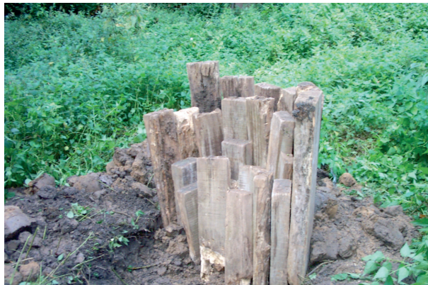
Figure 4. — An experiment in which oak timber with larvae from the school in Boitfort is moved to a nearby park to see if transplanting is possible.

Old orchards, broadleaved forest edges and steep afforested slopes where stag beetles are still present, disappear because of agriculture and forestry intensification and urbanization. In the meantime there is more attention for getting more open forests with more dead wood. A challenging question is whether the stag beetle will be able to recolonize these nearby forests while its present habitats are disappearing (Fig. 4). Therefore monitoring and active protection of the species (cf. Mendez, 2002) is needed.