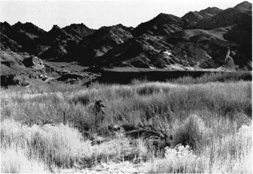
Figure 2. — Reeds in oasis, Transaltai, Gobi.