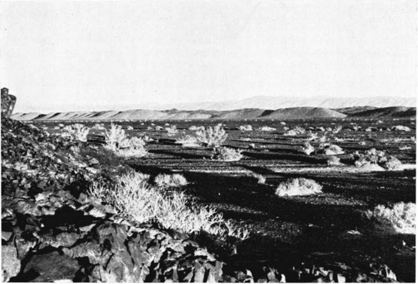
Figure 1. — Ephedra in dry river bed, Transaltai, Gobi.