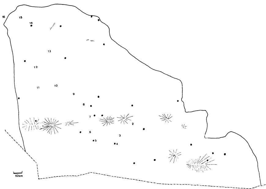
Map 2. — Planned Transaltai Gobi National Park.

In order to protect representative samples of the Central Asian desert and semi-desert ecosystems, together with their unique flora and fauna, the Government of the Mongolian People's Republic decided in 1975 to establish protected areas in the Transaltai and Djungarian Gobi areas. The Mongolian authorities subsequently contacted international organizations with a view to securing assistance from international sources in this endeavour. The 1976 mission was invited to Mongolia as a result of these contacts. It should be noted that the habitats in a large proportion of the areas proposed for protection are still undisturbed and that the remainder is only minimally affected by the activities of man. With the exception of the wild horse Equus przewalskii , there are satisfactory populations of the indigenous large mammals still thriving in these areas. Measures have already been taken, or are planned by the Mongolian Government, to exclude human activities from what will become the Transaltai Gobi National Park (Map. 2) and to strictly limit them in what will