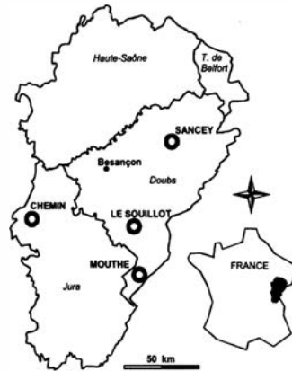
Figure 1. — Location of the study sites in eastern France.

from the 1988 General Agriculture Census (RGA) and the National Forest Census, both from the Ministry of Agriculture. Each site was representative of a stage of agriculture intensification along an altitude gradient.