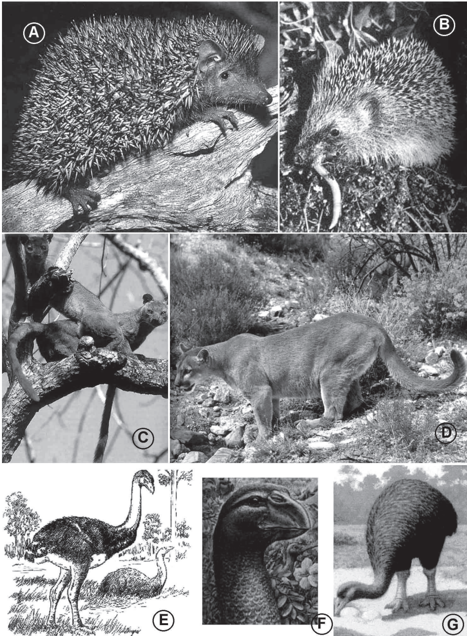
Figure 2. — Evolutionary convergence. The lesser hedgehog tenrec, Echinops telfairi (A) was originally placed in the same order as the European hedgehog, Erinaceus europaeus (B), although they belong to different branches of the placental mammals. Similarly, Cryptoprocta ferox (C), Madagascar's largest predator, was originally placed with the puma, Puma concolor (D) in the cat family, although molecular phylogeny places it in the mongoose family. Before human settlement, the largest herbivores of our focal land masses were birds, including Madagascar's largest elephant bird, Aepyornis maximus (E), which weighed 270 kg, New Zealand's largest moa, Dinornis giganteus (G), which weighed 140 kg, and the moa-nalos of the Hawaiian Islands, such as Kauai's Chelychelynechen quassus (F), which may have weighed 7 kg.