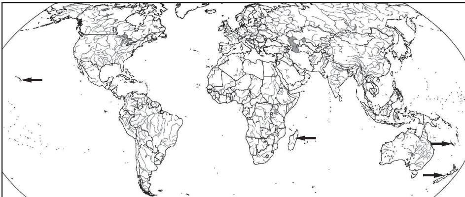
Figure 1. — Map showing the location, relative size, and degree of isolation of our four focal land masses (arrows): Madagascar, New Zealand, New Caledonia, and the Hawaiian Islands.

This paper will explore and test Darwin's ideas concerning these topics. This task has recently become much easier. Inventories of flowering plants, birds, mammals, etc. on different land masses are more complete, and the history, both natural and geological, of these land masses is better understood (e.g. Carlquist, 1980; Worthy & Holdaway, 2002; and especially Goodman & Benstead, 2003). The role of competition in adaptive divergence has been demonstrated more clearly. Clocked molecular phylogenies are increasingly available. Finally, Burness et al. 's (2001) study of how the sizes of a land mass' largest carnivore and its largest herbivore vary with its area has opened new perspectives. We will focus mainly on Madagascar, New Zealand, New Caledonia and the Hawaiian Islands (Fig. 1), comparing them with other land masses as appropriate. First, we will briefly outline the geological and biological history of these islands. Next, we assess the independence of the evolutionary experiments they harbored, comparing their degree of endemism, the role of colonists from overseas, and the extent of their adaptive radiations. We then discuss the relation between their distances from the nearest continents, and patterns of endemism and diversification in ferns, seed plants, and birds. Next we compare local and total diversity on isolated land masses of different area. To compare the severity of competition and the pace of life on different land masses, we first ask