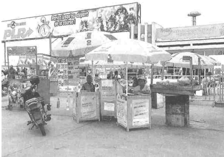
Telephone credit sellers in Cotonou (Benin).