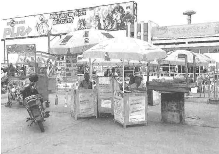
Telephone credit sellers in Cotonou (Benin).