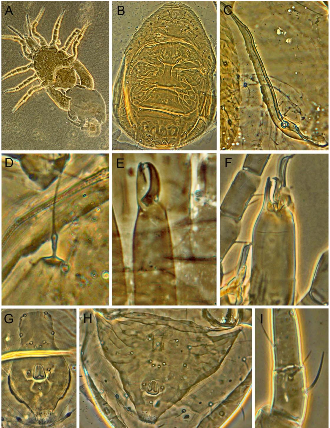
Figure 3 Microphotographs of Paragigagnathus sistaniensis n. sp. Kreiter, Arjmandi-Nezhad and Saboori: A — viviparity; B — dorsal idiosoma (Female); C — peritreme and peritremal shield; D — spermatheca; E — chelicera (Female); F — chelicera (Male); G — ventri-anal shield (Female); H — ventri-anal shield (Male); I — basitarsus IV. Not scaled.