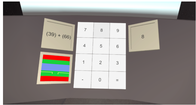
Figure 2: A visualization of the dual-task scenario. The user needs to do a mental calculation and to maintain a line in a specific interval at the same time. The application logs the user's errors, physiological signals, NASA-TLX answers, and the response time to audio beeps.

We presented a VR platform that can be used for stimulating and measuring the cognitive load in various ways.