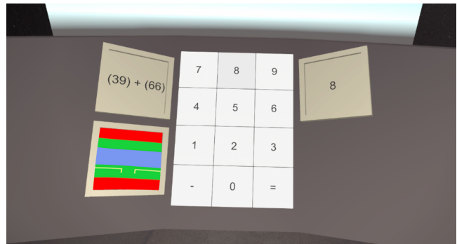
Figure 2: A visualization of the dual-task scenario. The user needs to do a mental calculation and to maintain a line in a specific interval at the same time. The application logs the user's errors, physiological signals, NASA-TLX answers, and the response time to audio beeps.

We presented a VR platform that can be used for stimulating and measuring the cognitive load in various ways.