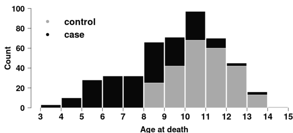
Figure 1. Distribution of age at death in 220 OSA-affected cases and 251 OSA-unaffected controls in Leonbergers.