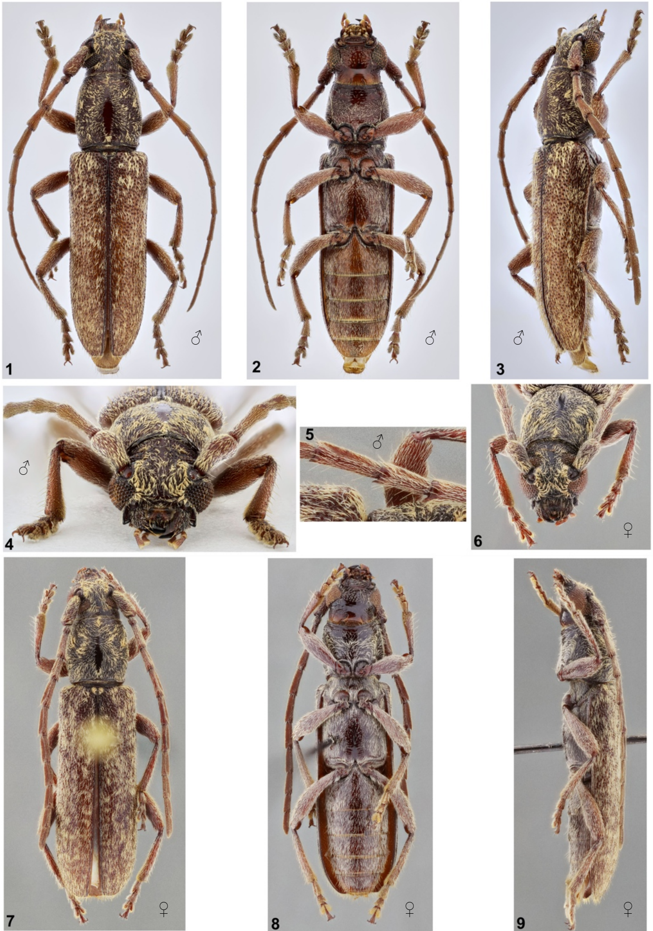
Figures 1-9. Anelaphus vandenberghai sp. nov.

1-5) Holotype, ♂: 1) Dorsal habitus; 2) Ventral habitus; 3) Lateral habitus; 4) Head, frontal view; 5) Antennomeres III-V. 6-9) Paratype, ♀: 6) Head, frontal view; 7) Dorsal habitus; 8) Ventral habitus; 9) Lateral habitus.