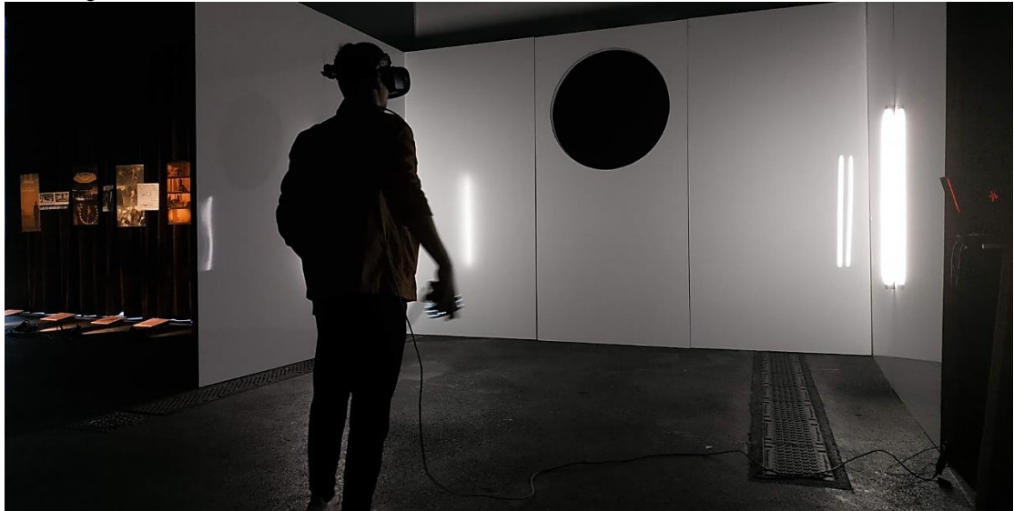
Figure 4 - VR design in a real built neutral environment, this neutral environment is than virtually augmented.

We started to experiment two things with our students. First sketching on a 3D model using TiltBrush. With this app it is literally possible to sketch in 3D on an imported model (which shall be light) and have the possibility to walk around, and freely draw details, additions, comments in real time. With Gravity Sketch, the user manipulates real geometry and is able to process a real technical design with shapes, curves, lines, imported models and much more. The very innovative way to work is given by the possibility to modify the model's scale on the fly and have a scaled model in the hand and then expand it and walk in a real scaled model. We know that we are at the very beginning of VR/AR developments and we are awaiting the opportunity to have more collaborative tools to be in a real process of sharing the design and knowledge.