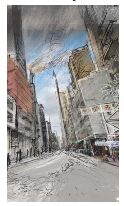
Figure 1 - Sketch over Google Streetview, by Olivier Chamel

The first step of the analytical phase of the project consists in using Google Street View as a two dimensional photographic tool. This graphic media provides an introductory approach to the spaces and surfaces of an existing street. Students initially create a scaled map of the urban space to be studied in order to get a sense of the context and understand the nature of the urban fabric. The map will also be used to reference the locations of the different perspective views. Though the 2D perspective views extracted from Google Street View are not at eye level and the point of view is located on a road, the