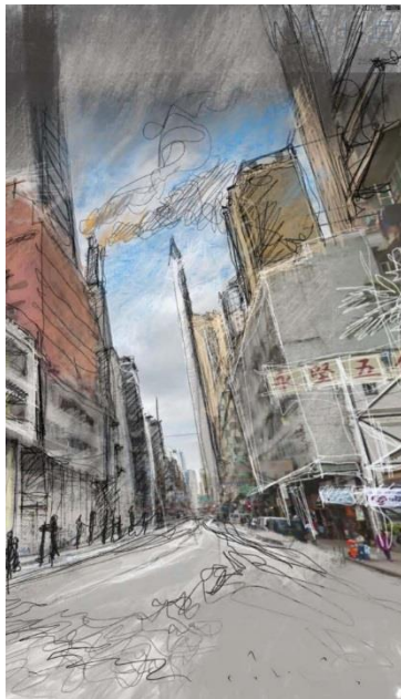
Figure 1 - Sketch over Google Streetview, by Olivier Chamel

The first step of the analytical phase of the project consists in using Google Street View as a two dimensional photographic tool. This graphic media provides an introductory approach to the spaces and surfaces of an existing street. Students initially create a scaled map of the urban space to be studied in order to get a sense of the context and understand the nature of the urban fabric. The map will also be used to reference the locations of the different perspective views. Though the 2D perspective views extracted from Google Street View