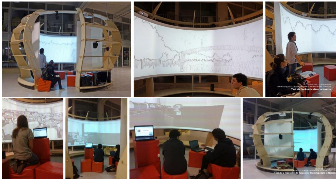
Figure 2 - Drawing at 220° in the Naexus

For three or four hundred dollars, it is now possible to buy a fairly good 360° camera. These types of camera are equipped with two 220° lens ,which instantly create a 360° image at a resolution of 4k for the most standard models. Controlled with a smartphone the camera creates an equirectangular image, meaning that the sphere is mapped on a 2.1 rectangle. It is then possible to redraw this image in two different ways. The first one consists in drawing directly on the flat image, though it typically involves geometric deformations from the sphere being flattened on a flat rectangle. Software such as Panopainting , which allows a real 360 VR painting constitute an improvement from the original set up. The equirectangular image is then remapped on a spherified cube that eases the redrawing.