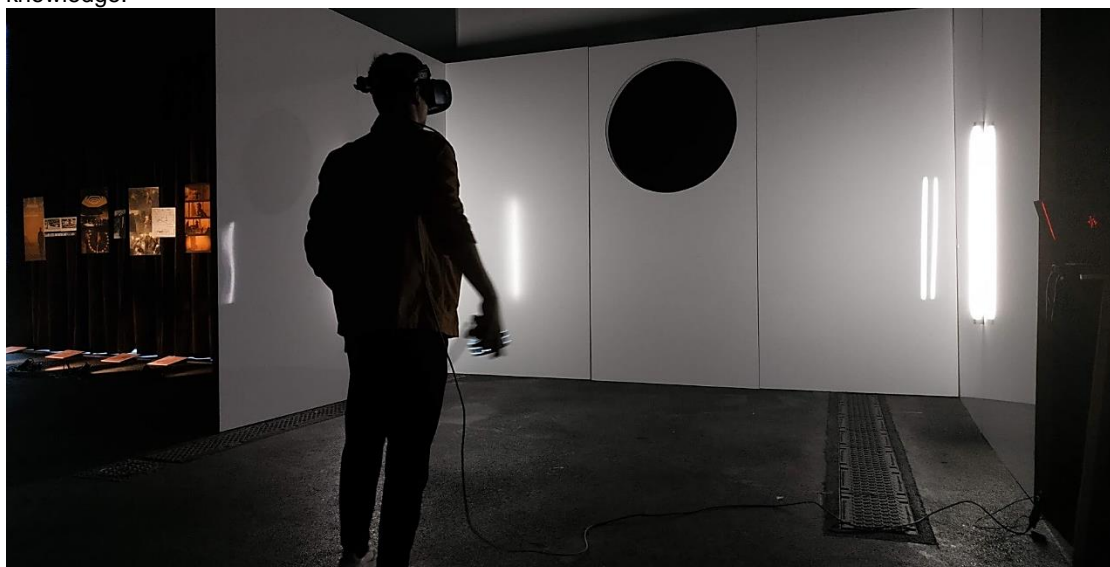
Figure 4 - VR design in a real built neutral environment, this neutral environment is than virtually augmented.

We started to experiment two things with our students. First sketching on a 3D model using TiltBrush. With this app it is literally possible to sketch in 3D on an imported model (which shall be light) and have the possibility to walk around, and freely draw details, additions, comments in real time. With Gravity Sketch, the user manipulates real geometry and is able to process a real technical design with shapes, curves, lines, imported models and much more. The very innovative way to work is given by the possibility to modify the model's scale on the fly and have a scaled model in the hand and then expand it and walk in a real scaled model. We know that we are at the very beginning of VR/AR developments and we are awaiting the opportunity to have more collaborative tools to be in a real process of sharing the design and knowledge.