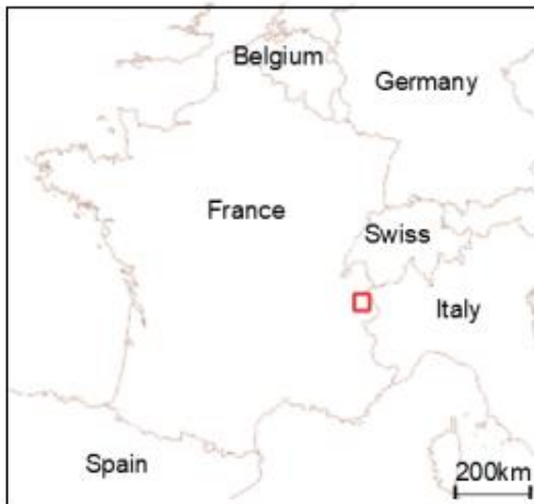
Figure 2: Area covered by the dataset.

The tile set represents a study area, in the north of the alps, located in Figure 2. As this dataset should be used to train and then evaluate deep learning models, the examples in this dataset should all show a good quality generalisation. In the same time, we want enough images to train the models with a subset and then evaluate them with the remaining images. A revision of the dataset might be required to guarantee both the quality and the quantity of images.