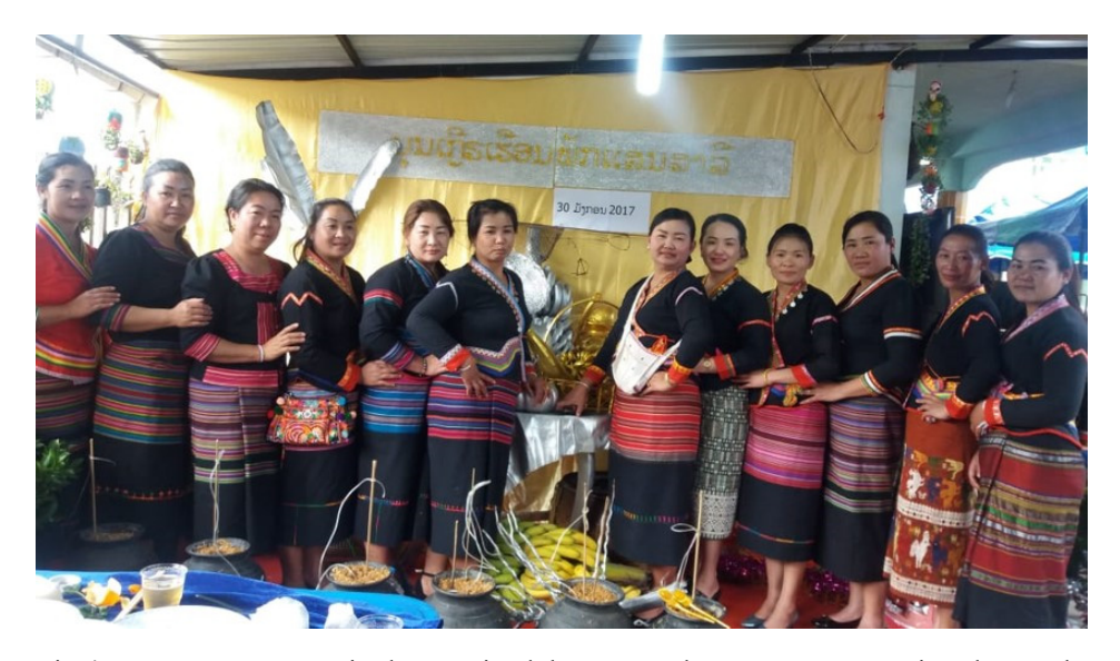
Pic.4 Boun Greu Festival organized by "Sensaly Guest House" in Phongsaly Province 2019 (the owner invites her friends, Khmu, Ho and Phounoy to celebrate and wear ethnic Khmu clothes

In this context, two tendencies related to religious conversion emerge among the Khmu. The first is a tendency to occasionally join the pagoda for practical reasons (for instance, for the cremation of the deceased; cemeteries do not exist in urban places, and the crematorium is the property of the Buddhist pagoda) and social motives. This Khmu-Buddhist conversion does generate generational conflict between, on the one hand, the older Khmu—who still say they believe in the "religion of the spirits"—and the younger ones who want to join the pagoda and the "religion of the Buddha" (because everybody is going). As the majority of converts do not master the Buddhist models, codes and rules, they are considered by other Buddhist ethnic groups in the city—the Phounoy, the Tai Lue—as second-rate Buddhists<sup>15</sup>. Note that the Khmu conversion to Buddhism is strongly endorsed by the state, which also encourages monks to