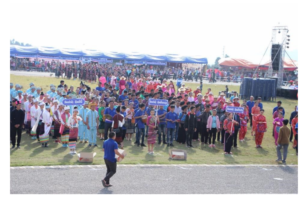
Pic.2 National Day Celebration, Phongsaly Province, Dec. 2018. The inhabitants of the province were invited to dress in the emblematic clothes of "their" ethnic group and to make a parade, representing the ethnic diversity of the province, for the celebration of the national day. A woman, at the head of each group, carries a sign with the name of the ethnic group.

"stages", and foreign experts — who were mistrusted before — are now invited to share their knowledge of specific groups or to participate in the creation of museums in the provinces (ibid.: 43).