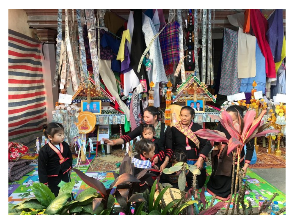
Pic.5 Buddhist Ceremony among the Phounoy in Honour of the Deceased, February 2019. Women and men now wear black clothes with red borders - an innovation based on a traditional costume that had not been worn for about 30 years.

Over the past few years and in this context, Phounoy ethnic songs and costumes—which were previously only used during provincial cultural or political festivals to highlight the multi-ethnicity of the province—have been introduced "offstage" into Buddhist ceremonies. The Phounoy wear their ethnic costumes during individual or family Buddhist temple events, such as ceremonies for the deceased or rituals to expel individual misfortunes or increase lifespan, etc. Instead of the spread of a standardized Buddhist way of practising coming from the capital Vientiane, one can observe an upholding of the old Phounoy—and also Tai Lue—way of performing ceremonies, different from the ethnic Lao practices.