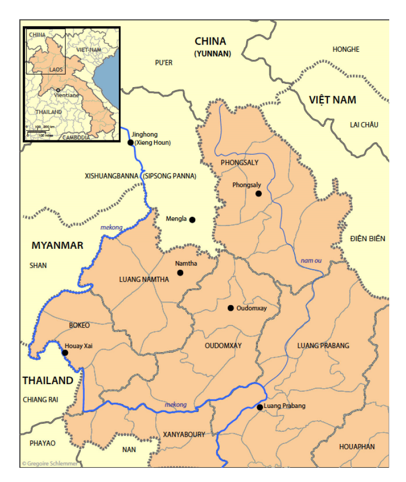
Pic.1 Map of Northern Laos and Phongsaly Province.