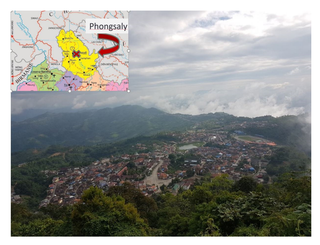
Pic.3 The provincial capital of Phongsaly province on heights of the mountain (1400m), Northern Laos, home to members from three "ethnic minorities"—the Khmu, the Phounoy and the Ho.

hegemonic authority of the state which attempts, as noted previously, to keep all this under control? To answer this question, we consider three different groups that are perceived as 'ethnic minorities'—the Khmu, the Phounoy and the Ho located in the provincial capital of Phongsaly province, in northern Laos<sup>13</sup>. I will present how these three groups respond differently to this state-enforced hybridization of tradition and religion<sup>14</sup>.