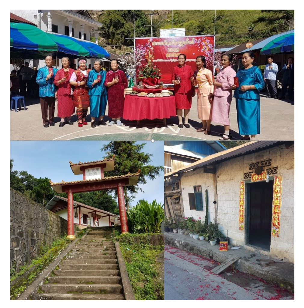
Pic.6 Above: Ho's New Year Celebrations, February 5, 2019. Below: left, the Ho temple (miaofang); right: a house decorated for the New Year. All elements (clothes, temple, Chinese characters) were much less visible in the public space twenty years ago.

elements are missing or forgotten, the Ho consult the Chinese rites on YouTube; there is an abundance of New Year's "Chinese" costumes (purchased over the border), and above all, an increasing interest in participating in this transnational 'great religion' practised by the Chinese of South East Asia, China and beyond.