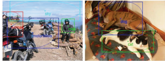
Figure 1. Examples of object detection and labeling results obtained with the game-based approach described in [3]: (left) four objects /regions were detected and their bounding boxes were labeled as ‘woman’, ‘sky’, ‘motorbikes’, and ‘man’; (right) two objects (‘cat’ and ‘dog’) were detected and labeled.

topological clues [3]. The information collected from game logs is combined with results from content analysis algorithms and used to feed a machine learning algorithm that outputs the outline of the most relevant regions within the image and their names (Figure 1). The approach solves two computer vision problems – object detection and labeling – in a single game and, as a bonus, allows learning of spatial relations (e.g., sky is above the man) within the image.