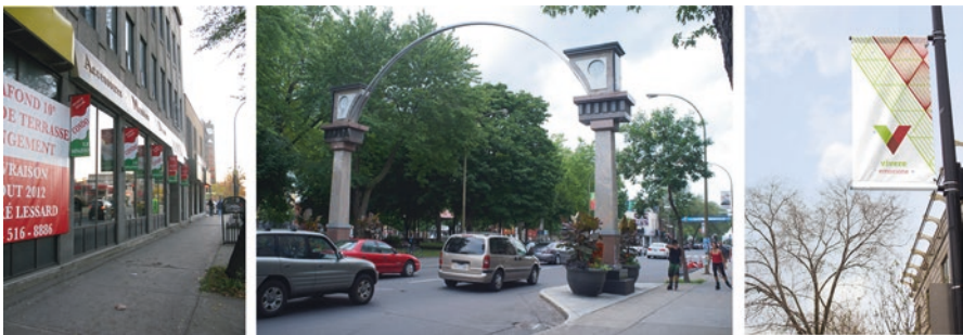
Fig. 9.2 Little Italy with colors of the Italian flag, arch on the boulevard and banner with the new slogan “Vivere Emozione.” (ML Poulot, 2013, 2015)

In the north of the boulevard, the commercial development association of Little Italy has oriented its branding toward a certain vision of Italy with arches, green-white-red flags, Italian connotations (Rome Antics, Café Italia, Corneli, Galleria della Sposa, etc.) for the names of shops, and decorations with the name of the neighborhood (see Fig. 9.2). 4 The SDC has also appointed the Toronto advertising company OPEN to set up a new branding strategy for the neighborhood. A logo and the slogan “vivere Emozione” have been created to let Little Italy stand out from the other neighborhoods (see Fig. 9.2). The letter V is supposed to be the symbol gathering different textures that refers to the urban multilayered neighborhood and identifies the three commercial components of Little Italy: gastronomy, sport and culture. The new official guide describes Little Italy with all the Italian references and clichés: