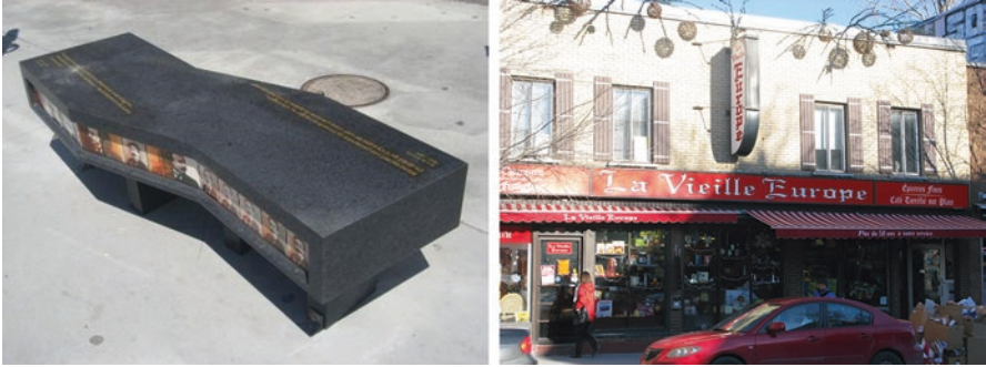
Fig. 9.3 The “benches of stone and words” and the shop “La Vieille Europe” on Saint-Laurent Boulevard (ML Poulot, 2012, 2013)

and writers (see Fig. 9.3). They are supposed to represent the Portuguese community, a bridge between Anglophone and Francophone and other communities. One of the members of the Portuguese community, who is also involved in the SDBSL, explains that they want to do something different than the Business Improvement Area in Toronto called Little Portugal that has existed since 2007: