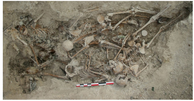
Figure 1. Main de Massiges, January 1915, strong offensive period. Germans soldiers buried quickly in a hole by their brothers in arms (excavation – Y. Desfosses 2014).

Even if the number of deaths is higher for the WWII than for the WWI, anthropological excavations of this period are rarer but some studies on Luftwaffe soldiers can be cited [2,7].