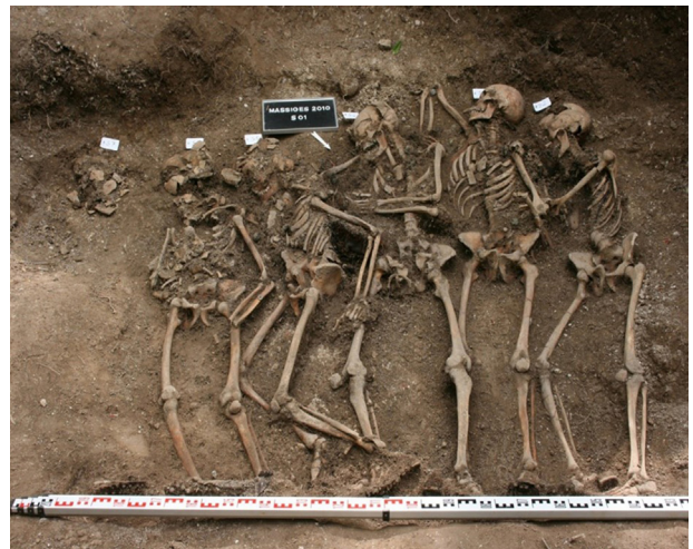
Figure 2. Main de Massiges, Cernay-en-Dormois, October 1915, lull in offensive. Germans soldiers buried in mass graves with great care (excavation – Y. Desfosses 2010).

Field information and archaeological facts can make it possible to identify a historical context, regardless of the period. Then laboratory studies are carried out. One of the first tasks is to research all the historical archives relating to the period estimated from the field data (from specific material for example). Indeed, one of the peculiarities of these contexts of armed conflict is the presence of very well documented military archives and historical accounts. The study of bone remains, the characterisation of peri-mortem traumas and sometimes the use of genetic tools should be able to provide a precise biological profile. Moreover, the integration of disciplines in the study of human remains from these contexts of conflict makes it possible, in some cases, to find names and attribute an identity to the bodies.