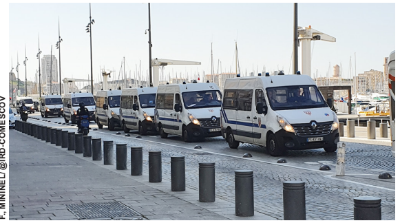
F. MININELLI @IRD-COMESCOV

Italians received the first news of the arrival of a new virus from China at the beginning of 2020 with relative nonchalance. The first Covid-19-positive patient was detected in Codogno on 21 February 2020, followed by two more, only days later (23 February) in the Seriana Valley near Bergamo, an economic powerhouse (Costanzo & Sapienza 2020; Nava 2020). The motto of the leaders of the Lombardy region, Italy's 'economic engine', was '#Milan keeps going' and '#Bergamo does not stop' (Gatti 2021). The two mayors of these cities who