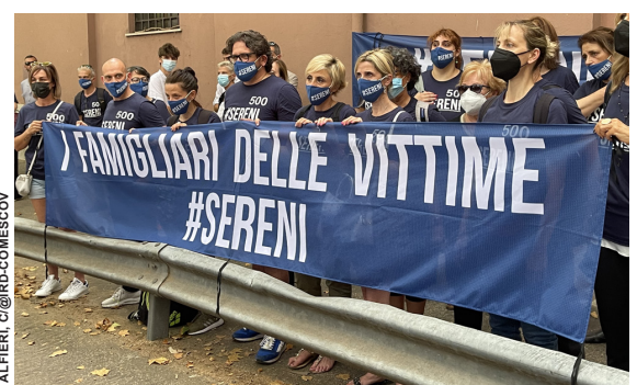
ALFIERI, C. @IRD-COMESCOV