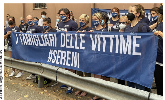
ALFIERI, C. @IRD-COMESCOV