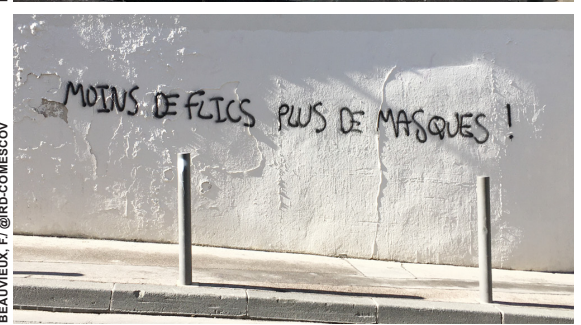
BEAUVIEUX, F. @IRD-COMESCOV