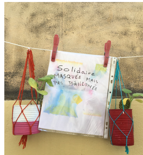
Fig. 1. 'In solidarity. Masked but not gagged'. Handmade sign hung outside a residence. Marseille, France, May 2021.

Although much of the population followed government orders and stayed home, some streets in the city centre became places where people who had no home in which to stay would gather; tram and bus stations became shelters for the 'confined outside'. Non-profit associations provided food, clothing, psychological support, nappies and mobile showers for those in need. Outside the institutional framework of humanitarian aid, other spontaneous citizens' initiatives were also launched, such as one organized by teachers and social workers in the Saint-Mauront neighbourhood, which shared food with families in the greatest need. A community member explained his role as a volunteer that brought him out of confinement and onto the streets: 'It's not the shut-ins that I have to accompany!