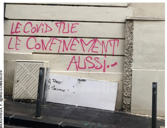
BEAUVIEUX, F. @IRD-COMESCOV