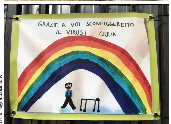
ALFIERI, C. @IRD-COMESCOV