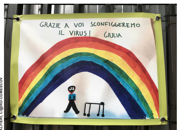
ALFIERI, C. @IRD-COMESCOV