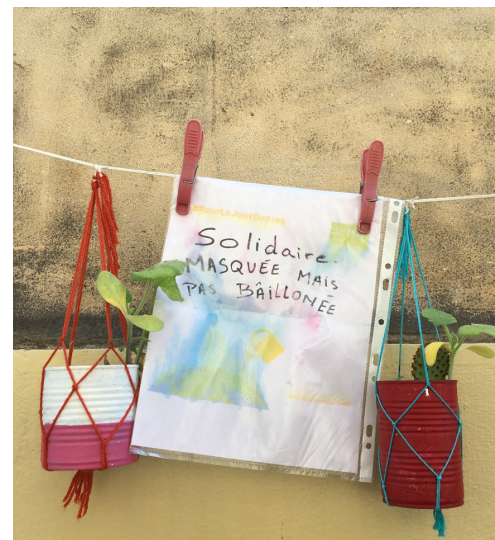
Fig. 1. 'In solidarity. Masked but not gagged'. Handmade sign hung outside a residence. Marseille, France, May 2021.

Although much of the population followed government orders and stayed home, some streets in the city centre became places where people who had no home in which to stay would gather; tram and bus stations became shelters for the 'confined outside'. Non-profit associations provided food, clothing, psychological support, nappies and mobile showers for those in need. Outside the institutional framework of humanitarian aid, other spontaneous citizens' initiatives were also launched, such as one organized by teachers and social workers in the Saint-Mauront neighbourhood, which shared food with families in the greatest need. A community member explained his role as a volunteer that brought him out of confinement and onto the streets: 'It's not the shut-ins that I have to accompany!