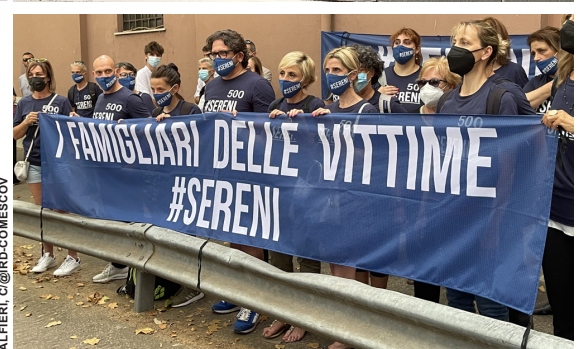
ALFIERI, C. @IRD-COMESCOV