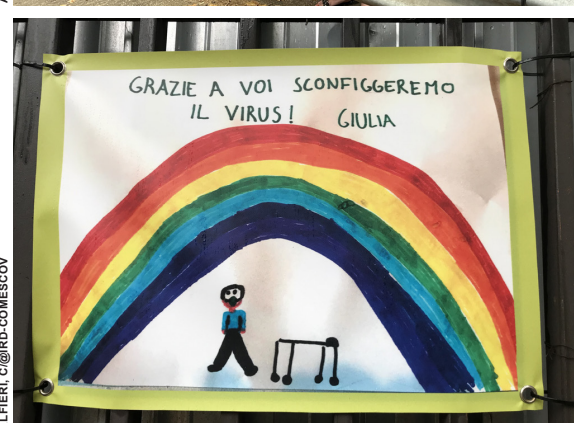
ALFIERI, C. @IRD-COMESCOV