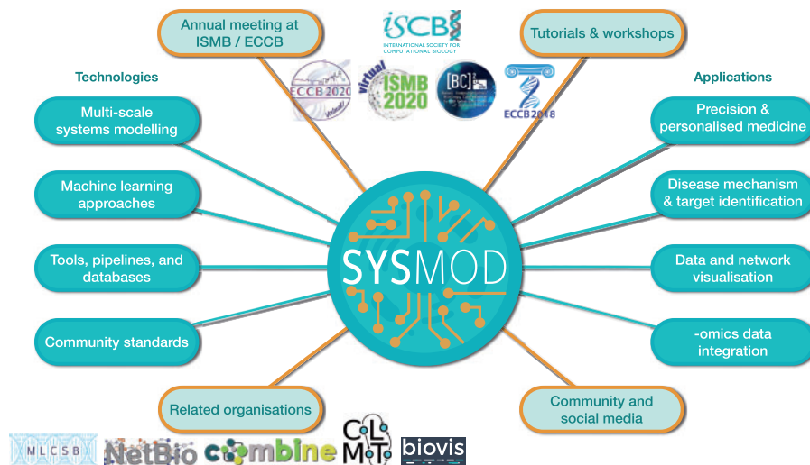
Fig. 1. Overview of the COSI SysMod. SysMod is an organisation within the ISCB that offers a variety of activities to its community, such as tutorials, workshops and annual meetings as part of the conferences ISMB/ECCB. To this end, it provides various channels for communication, including popular social media platforms and mailing lists. SysMod connects researchers from diverse fields whose expertise covers a plethora of topics on technologies and their applications. Members of the SysMod community are active in related organisations, such as those shown to the bottom left.