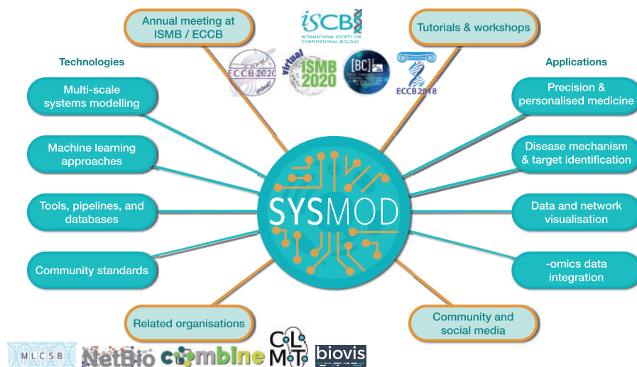
Fig. 1. Overview of the COSI SysMod. SysMod is an organisation within the ISCB that offers a variety of activities to its community, such as tutorials, workshops and annual meetings as part of the conferences ISMB/ECCB. To this end, it provides various channels for communication, including popular social media platforms and mailing lists. SysMod connects researchers from diverse fields whose expertise covers a plethora of topics on technologies and their applications. Members of the SysMod community are active in related organisations, such as those shown to the bottom left.