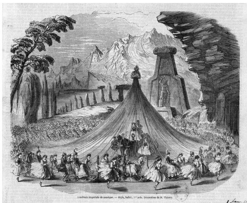
Fig. 3: Joseph Thierry: Orfa , ballet, 1 st act. Académie impériale de musique.