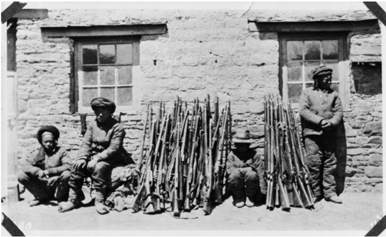
Figure 9 “Chinese and arms captured by Tibetans, 1910-11”.

regarding the same episode, that the Tibetan government stored the weapons seized from the Chinese including “rifles ( me mda' ), machine guns ( me shin 'gan ) and Lewis guns ( lu se 'gan )”. 120 What happened to these first generation machine guns is not entirely clear, as they are not quoted in other sources after 1912 121 and the import, much later, of Lewis guns from British India would then be presented as an additional innovation. In any case, after the end of the Chinese protectorate in Tibet, it was thanks to the new rapprochement with British India that a new chapter in firearms import began.