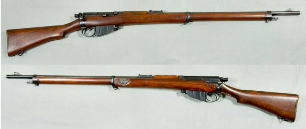
Figure 10 Example of a British Lee-Enfield Rifle Mk II, .303 caliber (1895). From the collections of the Armémuseum (Swedish Army Museum), Stockholm, Sweden (CC BY 4.0)

as well as on the Tibetan terminology. As stated, the weapons imports from British India started only in 1914, after the Simla Conference, with the initial sale of 5,000 Lee-Enfield rifles 125 (see [fig. 10]) taking .303 cartridges, of which 500,000 were also sold. 126 These rifles were called in Tibetan dbyin mda' kha ring , 127 lit. 'British long barrel long gun'. 128