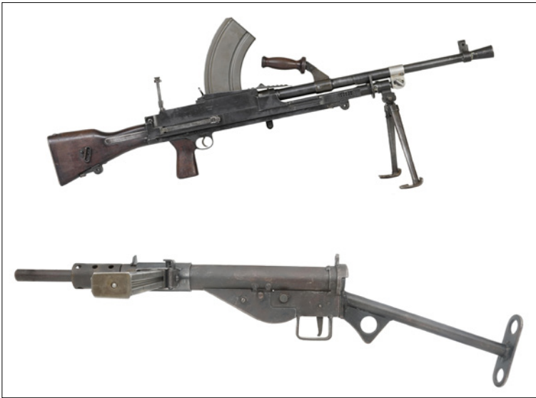
Figure 15 Example of a Bren gun: BREN Mark 2 gas operated/tilting bolt machine gun, manufactured by Enfield, UK.