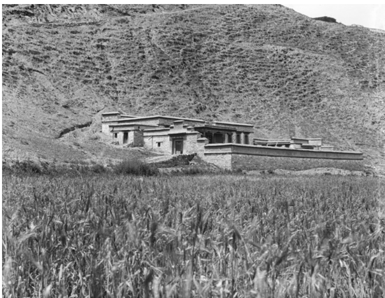
Figure 4 “Chakpori Powder Magazine”.