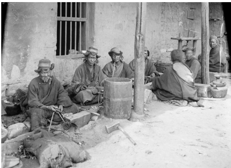
Figure 6 “The Arsenal in Lhasa”. 1920-01, PRM 1998.286.46, probably being the Métok kyitsel arsenal located in the Lugu or Yamön area