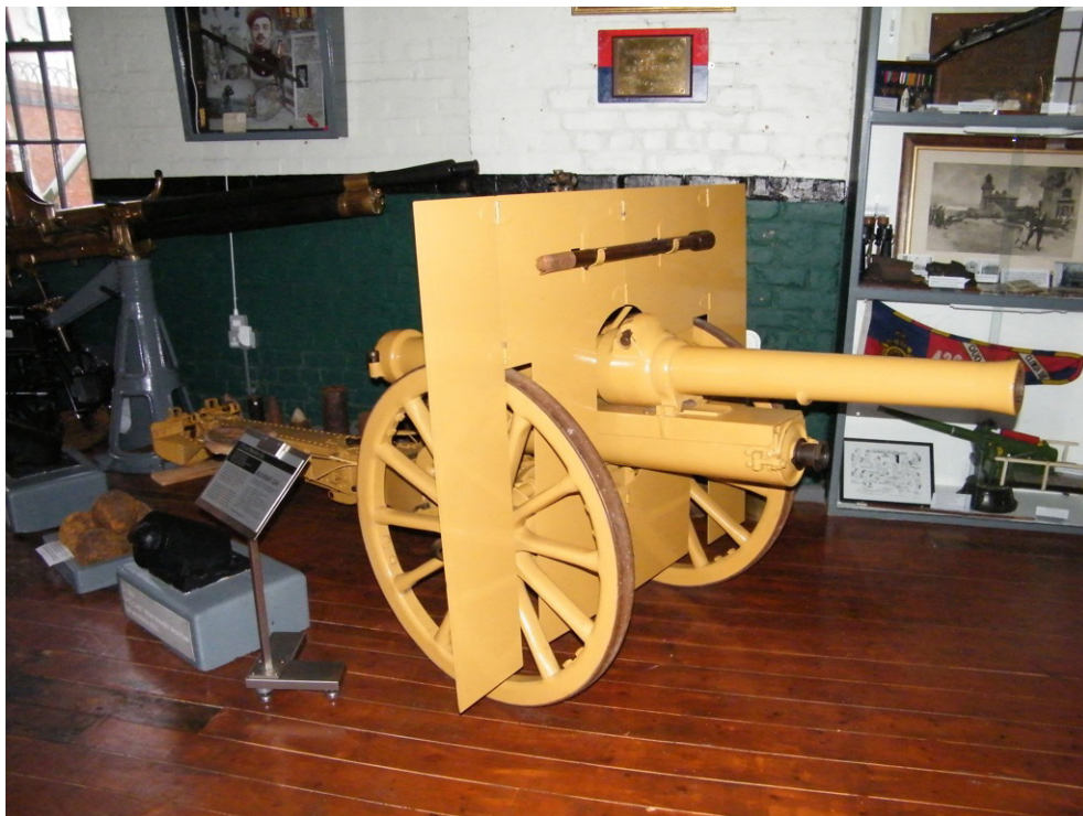
Figure 18 Example of an Ordnance BL 2.75-inch mountain gun (Heugh Battery Museum, Hartlepool, UK, CC BY-SA 3.0)

In October 1944, the Trapchi regiment ( grwa bzhi kha dang dmag sgar ) was receiving instruction in the Ordnance BL 2.75-inch mountain gun (see [fig. 18]) from the Bodyguard regiment, who had learned its operation from the British in Gyantse and Lhasa early in 1944. 185