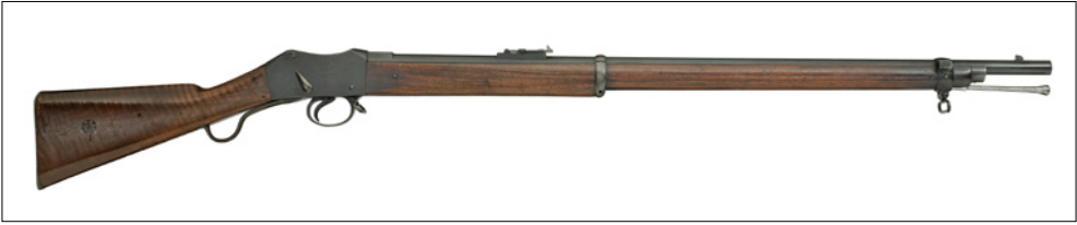
Figure 5 Example of a Martini-Henry rifle (breechloader): Martini-Henry MK.1.