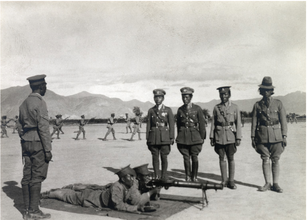
Figure 11 Example of a British short magazine Lee-Enfield Mk I (1903), .303 caliber.