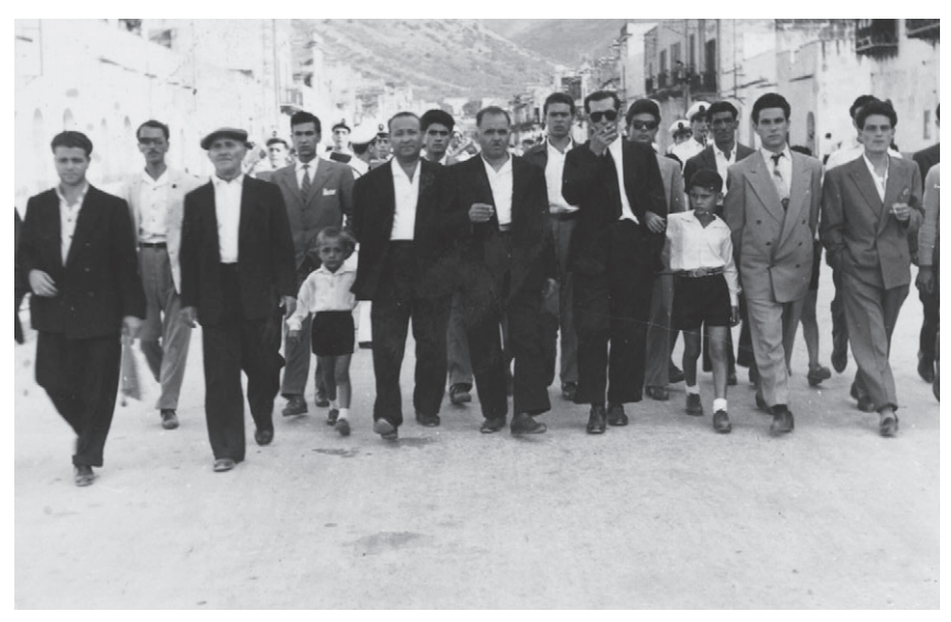
Figure 9: Young Peppino Impastato (front row, third from right) holding the arm of his father (a mafioso), walking alongside one of Baladamenti's brothers. (Source: Family archive Felicia Bortolotta Impastato).

fact that members of a mafiosi family made recourse to the state's justice system could be considered as a historic transgression of the omertà code, the central element of its mental and cultural universe. According to folklorist Pitrè ([1889] 1944: 295), omertà commands one not to denounce the violence one has suffered to representatives of the law. The fact that members of Impastato's family did so thus can be seen as a sign of change in attitude not only toward the mafia but also toward the state.