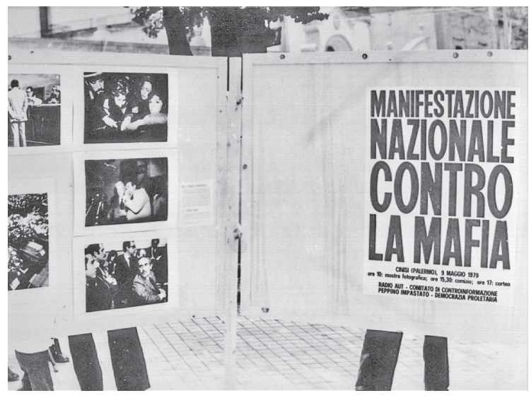
Figure 3: National demonstration against the mafia.

was to deconstruct the image of the mafia as a Sicilian way of being, which many connected to positive values such as pride, courage, solidarity, friendship, commitment to the family and group, honor, and even piety, and to replace it with its other, negative face. For this, the exhibitions wanted to make visible the mafia's negative side and to provoke at least a reaction in the viewers if not lead them to ask more critical questions. These photographic installations can be viewed as a provocation, challenging the cultural practice of turning a blind eye toward the mafia, a phenomenological condition that allowed the maintenance of omertà: if you had not seen anything, you could not speak about it. The photographers countered this practice by using a visual device that forced the viewer to come face to face with images depicting the violence and destruction caused by the mafia—by photographs that were in the way, that created an obstruction in public spaces—thus forcing the viewer to confront this reality and make sense of it (see Figure 4). This posture of engagement directly challenged the haziness that existed around what the mafia is: the mafia acquired a concrete meaning, one that was visible, tangible, and intelligible.