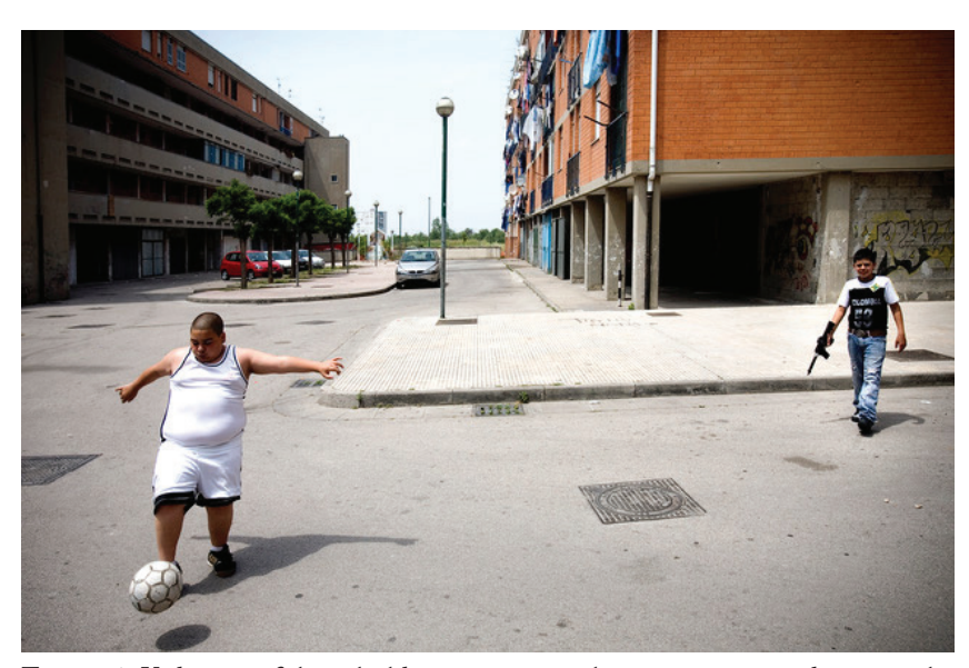
Figure 6: Kids, one of them holding a weapon, play games in a rundown neighborhood of Naples.