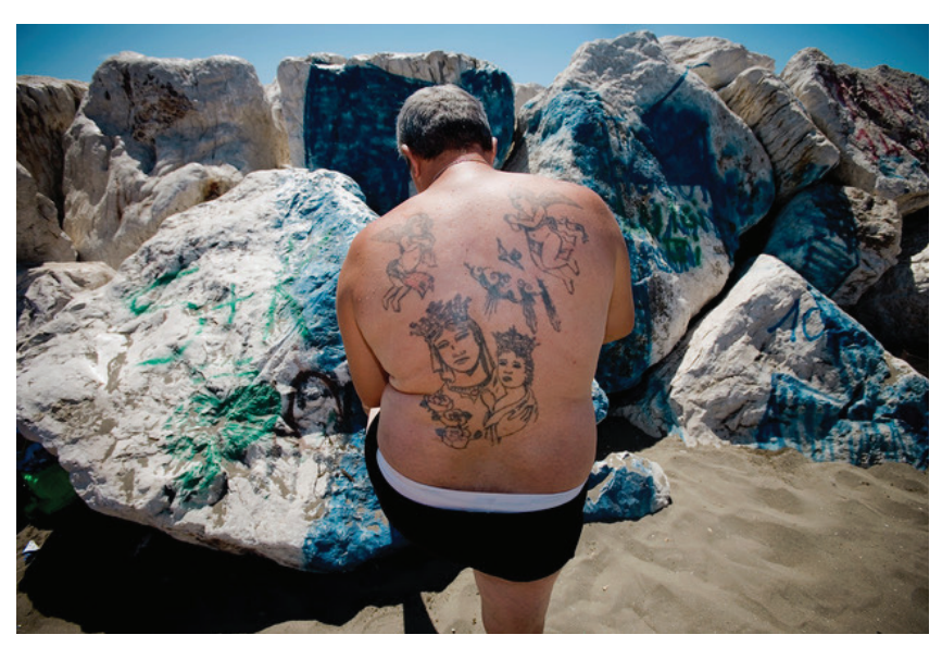
Figure 7: Tattoos on skin and rocks.

Mauro D'Agati, published in Napule Shot (D'Agati 2010), on his experience sharing everyday life with a Camorra group. The artist did not conceive of his work as a political act or civic duty.<sup>7</sup> He photographed the Camorra from the inside, taking pictures of its members engaging in daily activities: eating, playing games, performing music, holding festivals, manufacturing cocaine, marrying, engaging in street skirmishes with the police, being arrested. Environmental degradation is still there as the backdrop. But the aesthetic code has changed. It is not the black and white of the Zecchin and Battaglia images anymore, but the use of bright colors, showing happy and relaxed faces and people in nonchalant poses: men wearing witches' masks and preparing cocaine (Figure 5), boys playing football or handling a weapon (Figure 6). The dramatic tension is gone. The images show that the Camorrists do not want to hide but to showcase themselves, as when they expose their tattooed bodies to the sun, blending in with the stones that are covered with graffiti (Figure 7). Their lives are not concealed but openly displayed. The images show a mafia that is integrated into its environment, where there is no stigma attached to it, where it is not seen as a plague. Being illegal is presented as an ordinary way of living. The images suggest that