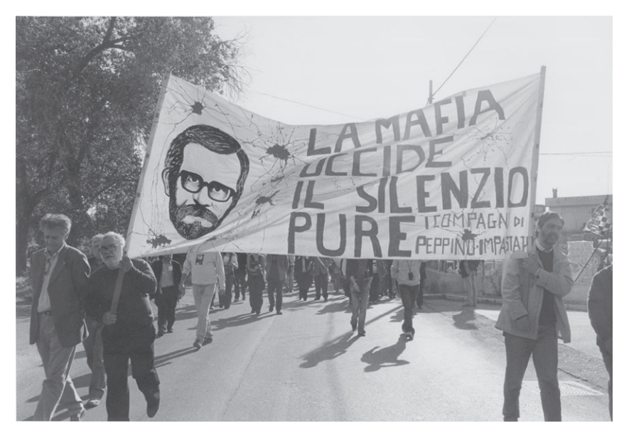
Figure 8: "The mafia kills, so does your silence – Peppino Impastato's comrades," anti-mafia demonstration (Source: Photo archive Centro Siciliano di Documentazione Giuseppe Impastato).

name in their flyers, documented the damage done by mafia activities through photographs (see chapter 3), and publicly spoke out on Radio Aut about the dysfunctional local administration—thus revealing the intrigues at the heart of the town council of Cinisi, which they nicknamed "Mafiopoli." Even more shocking, these young rebels ridiculed the so-called men of honor, mocked their supposed faith in God, insulted them, and so sullied their most precious form of capital: honor. In this phase, Impastato was in the position of the aggressor, if it is indeed true that "to publicly accuse one or more people is, in any case, to do violence to them, to attack their reputation, the consideration they enjoyed up to that moment or, to put it the old-fashioned way, their 'honor" (Boltanski and Claverie 2007: 415).