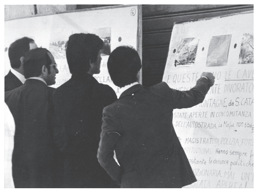
Figure 4: Posters bringing people face to face with the mafia.

power of these images depended on their contextualization. In their exhibitions, Battaglia and Zecchin replaced the media's routine chronological order of daily crimes and murders with the new logical order they created with the sequence they gave to their exhibits. In this way they provided continuity for what was considered discontinuous: poverty, degradation, corruption, and mafia violence. For this, they employed the heuristic device of the photomontage (Didi-Huberman 2009) to push forward a new visual order: bringing the mafia into an order of visibility and thus increasingly drawing it out of its invisibility. More than that, the montages embedded the mafia in a narrative, suggested a way of reading the images, and pointed out the hidden that should not be ignored. As a pedagogical tool, such a montage not only had to show that the mafia existed but also to tell the viewer what it was. The "duty to report," as the photographers described their task many years later (Battaglia and Zecchin 2006), was connected with the citizen's right to know. But, prior to this, it was connected to the citizen's need to know how to see, how to read, and how to interpret the pictures—of killings, attacks, poverty, corruption—in order to recognize the links between