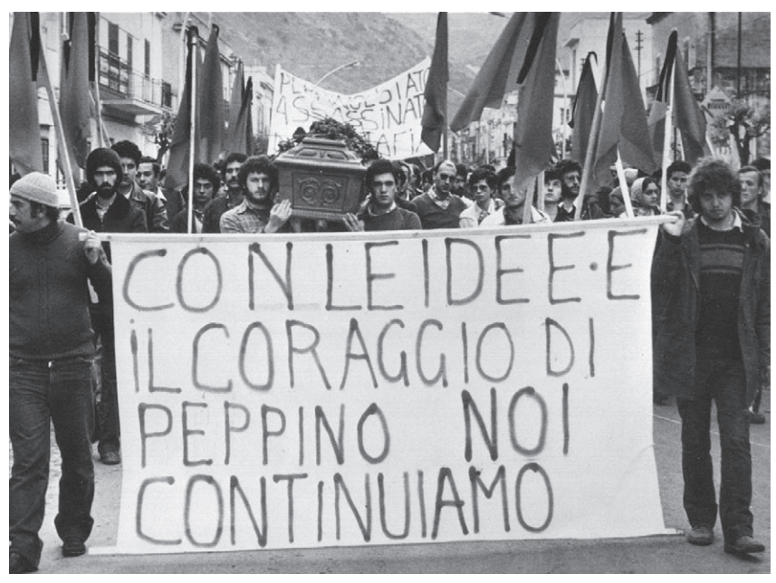
Figure 11: Peppino Impastato's funeral procession: "Driven by Peppino's ideas and bravery, we will carry on."

In 1992, fifty thousand people from all over Italy participated in the state funeral of Falcone, Morvillo, and three of their bodyguards. The following year more than one hundred thousand publicly commemorated the Capaci massacre. During the quarter century between the murder of Impastato and his recognition as a victim of the mafioso Badalamenti, mafia violence and the repressive response by the state opened questions on the limits of legitimate force in a democracy (Sciascia 2002), just as the Italian state was acquiring new legitimacy. It should not be assumed that there is linearity across the process of naming and judging the mafia, and reasserting the state monopoly of legitimate violence. The current absence of spectacularly violent Cosa Nostra attacks should not be read as a victory of the state or the law, or as a reaffirmation of the legitimate monopoly by the state of physical force, but as a return to the regime of invisible violence. Falcone (1994: 123) had indeed warned: "Contrary to common thinking, in fact, mafia power is the highest precisely where its external manifestation is at a minimum, that is, where life seems to pass in total tranquility." After his death in May 1992, the arrest of Riina in