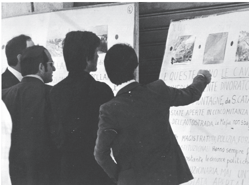
Figure 4: Posters bringing people face to face with the mafia.

power of these images depended on their contextualization. In their exhibitions, Battaglia and Zecchin replaced the media's routine chronological order of daily crimes and murders with the new logical order they created with the sequence they gave to their exhibits. In this way they provided continuity for what was considered discontinuous: poverty, degradation, corruption, and mafia violence. For this, they employed the heuristic device of the photomontage (Didi-Huberman 2009) to push forward a new visual order: bringing the mafia into an order of visibility and thus increasingly drawing it out of its invisibility . More than that, the montages embedded the mafia in a narrative, suggested a way of reading the images, and pointed out the hidden that should not be ignored. As a pedagogical tool, such a montage not only had to show that the mafia existed but also to tell the viewer what it was . The "duty to report," as the photographers described their task many years later (Battaglia and Zecchin 2006), was connected with the citizen's right to know. But, prior to this, it was connected to the citizen's need to know how to see, how to read, and how to interpret the pictures—of killings, attacks, poverty, corruption—in order to recognize the links between