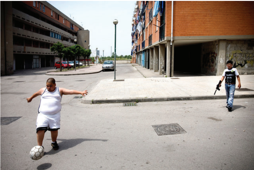
Figure 6: Kids, one of them holding a weapon, play games in a rundown neighborhood of Naples.