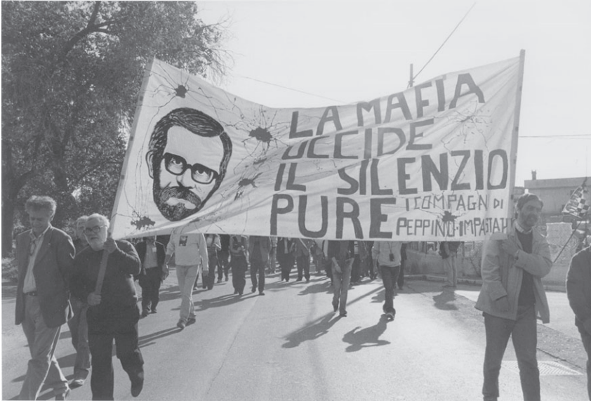
Figure 8: “The mafia kills, so does your silence – Peppino Impastato’s comrades,” anti-mafia demonstration (Source: Photo archive Centro Siciliano di Documentazione Giuseppe Impastato).

name in their flyers, documented the damage done by mafia activities through photographs (see chapter 3), and publicly spoke out on Radio Aut about the dysfunctional local administration—thus revealing the intrigues at the heart of the town council of Cinisi, which they nicknamed “Mafiopoli.” Even more shocking, these young rebels ridiculed the so-called men of honor, mocked their supposed faith in God, insulted them, and so sullied their most precious form of capital: honor. In this phase, Impastato was in the position of the aggressor, if it is indeed true that “to publicly accuse one or more people is, in any case, to do violence to them, to attack their reputation, the consideration they enjoyed up to that moment or, to put it the old-fashioned way, their ‘honor’” (Boltanski and Claverie 2007: 415).