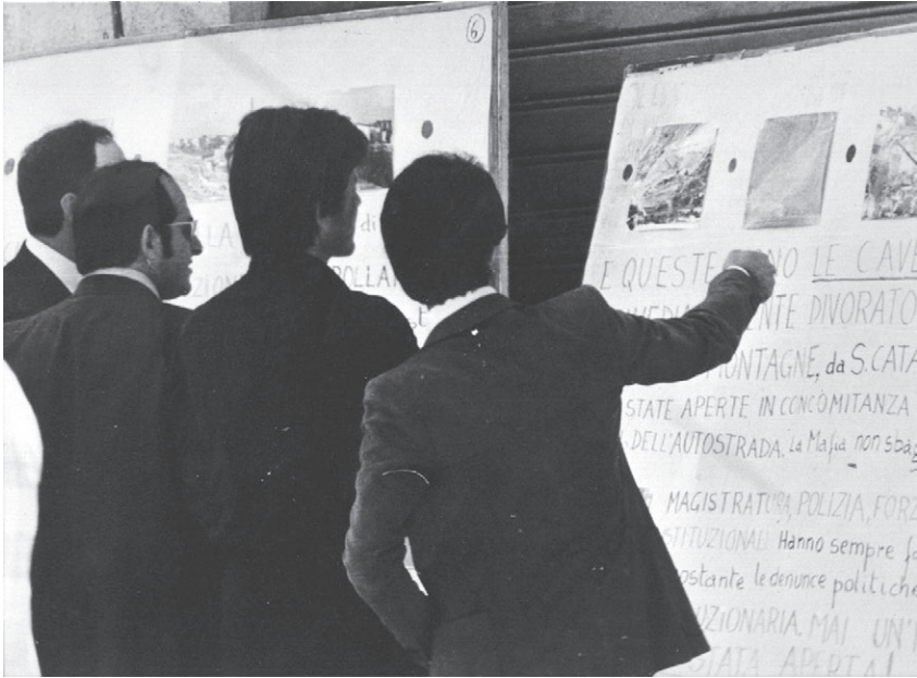
Figure 4: Posters bringing people face to face with the mafia.

power of these images depended on their contextualization. In their exhibitions, Battaglia and Zecchin replaced the media's routine chronological order of daily crimes and murders with the new logical order they created with the sequence they gave to their exhibits. In this way they provided continuity for what was considered discontinuous: poverty, degradation, corruption, and mafia violence. For this, they employed the heuristic device of the photomontage (Didi-Huberman 2009) to push forward a new visual order: bringing the mafia into an order of visibility and thus increasingly drawing it out of its invisibility . More than that, the montages embedded the mafia in a narrative, suggested a way of reading the images, and pointed out the hidden that should not be ignored. As a pedagogical tool, such a montage not only had to show that the mafia existed but also to tell the viewer what it was . The "duty to report," as the photographers described their task many years later (Battaglia and Zecchin 2006), was connected with the citizen's right to know. But, prior to this, it was connected to the citizen's need to know how to see, how to read, and how to interpret the pictures—of killings, attacks, poverty, corruption—in order to recognize the links between