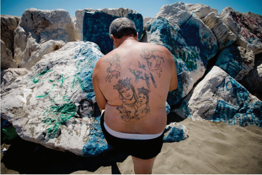
Figure 7: Tattoos on skin and rocks.

Mauro D'Agati, published in Napule Shot (D'Agati 2010), on his experience sharing everyday life with a Camorra group. The artist did not conceive of his work as a political act or civic duty. 7 He photographed the Camorra from the inside , taking pictures of its members engaging in daily activities: eating, playing games, performing music, holding festivals, manufacturing cocaine, marrying, engaging in street skirmishes with the police, being arrested. Environmental degradation is still there as the backdrop. But the aesthetic code has changed. It is not the black and white of the Zecchin and Battaglia images anymore, but the use of bright colors, showing happy and relaxed faces and people in nonchalant poses: men wearing witches' masks and preparing cocaine (Figure 5), boys playing football or handling a weapon (Figure 6). The dramatic tension is gone. The images show that the Camorristi do not want to hide but to showcase themselves, as when they expose their tattooed bodies to the sun, blending in with the stones that are covered with graffiti (Figure 7). Their lives are not concealed but openly displayed. The images show a mafia that is integrated into its environment, where there is no stigma attached to it, where it is not seen as a plague. Being illegal is presented as an ordinary way of living. The images suggest that