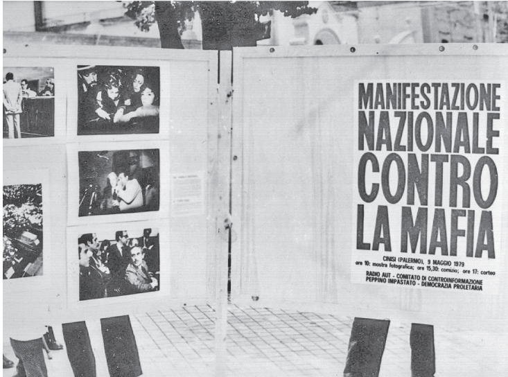
Figure 3: National demonstration against the mafia.

was to deconstruct the image of the mafia as a Sicilian way of being, which many connected to positive values such as pride, courage, solidarity, friendship, commitment to the family and group, honor, and even piety, and to replace it with its other, negative face. For this, the exhibitions wanted to make visible the mafia's negative side and to provoke at least a reaction in the viewers if not lead them to ask more critical questions. These photographic installations can be viewed as a provocation, challenging the cultural practice of turning a blind eye toward the mafia, a phenomenological condition that allowed the maintenance of omertà : if you had not seen anything, you could not speak about it. The photographers countered this practice by using a visual device that forced the viewer to come face to face with images depicting the violence and destruction caused by the mafia—by photographs that were in the way, that created an obstruction in public spaces—thus forcing the viewer to confront this reality and make sense of it (see Figure 4). This posture of engagement directly challenged the haziness that existed around what the mafia is: the mafia acquired a concrete meaning, one that was visible, tangible, and intelligible.