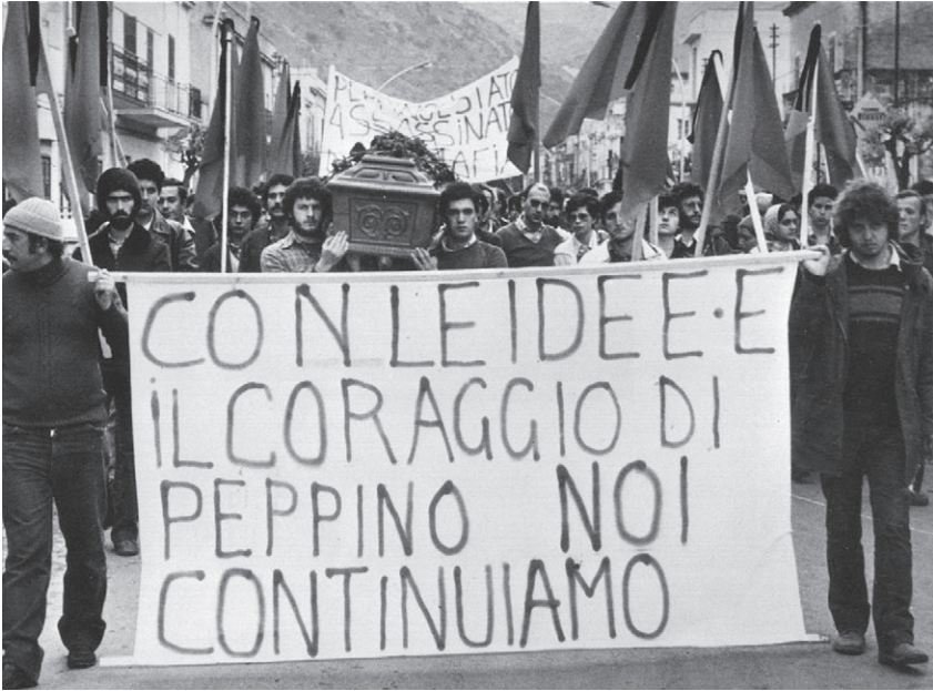
Figure 11: Peppino Impastato's funeral procession: "Driven by Peppino's ideas and bravery, we will carry on."

In 1992, fifty thousand people from all over Italy participated in the state funeral of Falcone, Morvillo, and three of their bodyguards. The following year more than one hundred thousand publicly commemorated the Capaci massacre. During the quarter century between the murder of Impastato and his recognition as a victim of the mafioso Badalamenti, mafia violence and the repressive response by the state opened questions on the limits of legitimate force in a democracy (Sciascia 2002), just as the Italian state was acquiring new legitimacy. It should not be assumed that there is linearity across the process of naming and judging the mafia, and reasserting the state monopoly of legitimate violence. The current absence of spectacularly violent Cosa Nostra attacks should not be read as a victory of the state or the law, or as a reaffirmation of the legitimate monopoly by the state of physical force, but as a return to the regime of invisible violence. Falcone (1994: 123) had indeed warned: "Contrary to common thinking, in fact, mafia power is the highest precisely where its external manifestation is at a minimum, that is, where life seems to pass in total tranquility." After his death in May 1992, the arrest of Riina in