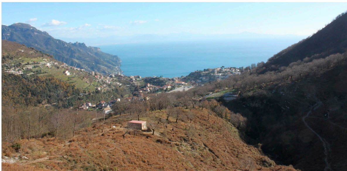
Figure 2. The pre-protolithic sites of the Amalfi Coast are hidden in the landscape: a Bronze Age site has been identified on the plateau in the foreground.

Starting from the research, it will be possible to obtain a complete enhancement of the prehistoric archaeological heritage of the Lattari Mountains-Amalfi Coast, capable of combining correct communication of knowledge of the prehistory of the area and the effective use of the related contexts/sites, mostly located in a mountain environment and characterized by low attractiveness, as they are hidden in the landscape (Figure 2).