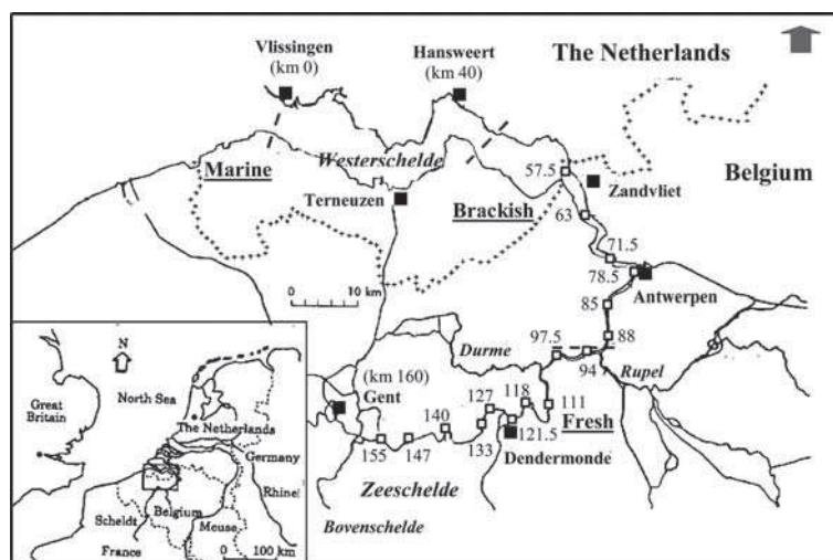
Figure 1. Positioning (inset) and map of the Schelde estuary showing the brackish and the fresh water zone. Numbers are distance in km from mouth at Vlissingen of stations used for monitoring in the OMES project.

200 l of water was pumped at 2.5 m below surface, at 2.5 m above bottom and at mid-depth and filtered through a 50 \mu m sieve and the three samples were pooled. In all other cases, 50 l was taken from the surface and filtered through a 50 \mu m net. Samples were stored in 4% formaline and abundance analysed under binocular microscope. Taxa were grouped as Rotifera, Copepoda (copepodites and adults) and Branchiopoda. Significance of trends in abundance with time were tested by Spearman rank at p < 0.5 , and differences in abundance between time periods by Mann–Whitney at p < 0.05 . Oxygen concentrations for the same zones and months were obtained from essentially the same sources as the zooplankton data, but not always sampled at the same location and at the same time as zooplankton.