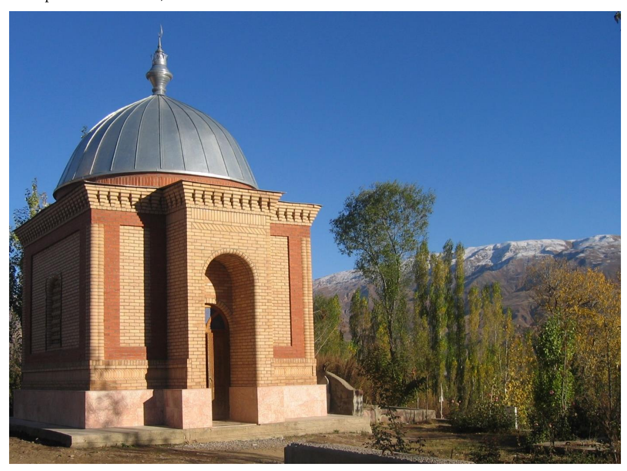
Figure 4: Erected since 1995, the shrine complex of Ishan 'Abd al-Rahim Dawlat, in Ilaq, developed in a remote area thanks to the Muhajirs' partial recolonization of their highlands quitted since 1947 (photo of late October 2005).

Despite the insistence of the lineages of builders on the significance of the tombs built to the glory of their pious forefathers, not all of them—far from it—have become objects of pilgrimage. Their frequentation at the turn of the century seems to have depended as much on the existence of a nascent and popular hagiographic tradition as on the more or less favorable location of the tomb. We have briefly mentioned the small domed shrine with trees decorated with lata-bandis left by visitors in search of intercession, erected on the Dushanbe–Danghara road for Sang-i Kulula, a locally renowned saint active in the second third of the twentieth century, whose grave was visited in the 2000s by many travelers rarely aware of the name of the saint, who then remained deprived of a textual hagiography. It is, on the contrary, the existence of widely circulated vitae that distinguishes Ishan 'Abd al-Rahman–Jan and, together with him, several figureheads of the same Dahbidi lineage (among whom another saint from Qarategin, Ishan 'Abd al-Rahim Dawlat Ilaqi, whose gnostic poems have been published in 2000).<sup>89</sup>