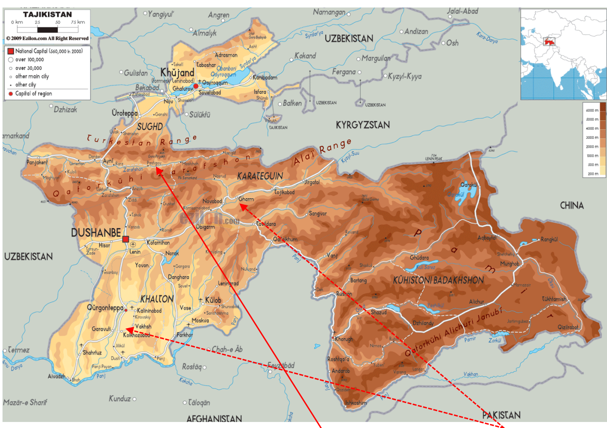
Figure 2: Tajikistan, physical, with the distinction of the Zerafshan, in the north, and of the Wakhsh, in the south, River Valleys (source: Elizon Maps)

stan as the cradle of a modern Sunni Persian-language identity; the Persianate world of modern Naqshbandi networks; and, beyond, the umma as a whole. (For this, the role of hub played by Eastern Iran since the 1990s, for the redeployment of the Central Asian Naqshbandiyya at continental scale, has been instrumental.)<sup>55</sup> It should be noted that the relative protection that these lineages enjoyed during the last decades of the Soviet period, sheltered by the impassable borders of the USSR, also made this period, for the baby-boomer generation born just after the mass population resettlements of 1946–7, a kind of golden age of Central Asian Islam, often remembered to until the mid-2010s with paradoxical (for an external observer) nostalgia.