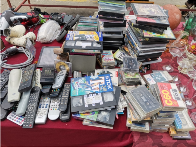
Fig. 4: Târgul Valea Cascadelor, a flea market where videotapes (mostly VHS) and DVDs are available for sale.

The sale and purchase of analogue videotapes (such as VHS, video8, or Hi8) and digital videotapes – MiniDV’s – is a completely different matter. Unlike films, video recording media are sold for reuse. The price, fixed by each seller, is indexed to the quality of the technical components of the tape. The first criterion, following a utilitarian logic, is of course the resolution of the format, i.e. the amount of information that can be recorded on the tape – VHS tapes have only 240 lines of horizontal resolution, while video8 and Hi8 tapes contain 280 and 440 lines respectively, so they are more expensive. Next comes the length (in minutes) of the tape, and finally the rarity and reliability of the brand and model. This price scale is set by all sellers with the prospect that the tapes will be reused or, more rarely, displayed as decorative knick-knacks in shops, never to be actually put to use. None of my contacts had met customers interested in magnetic tapes for what they contain. During our telephone conversation,[25] Sorin, a collector and dealer of various rock sub-culture artifacts and hi-fi equipment, explained to me that TDK brand audio (and sometimes video) tapes, including MA, MA-X, MA-XG (MA for Metal Alloy) tapes, are known for their robustness and precision by collectors who wish to have a model missing from their collection. It does not matter if the tapes are blank or already used. The images recorded are never mentioned