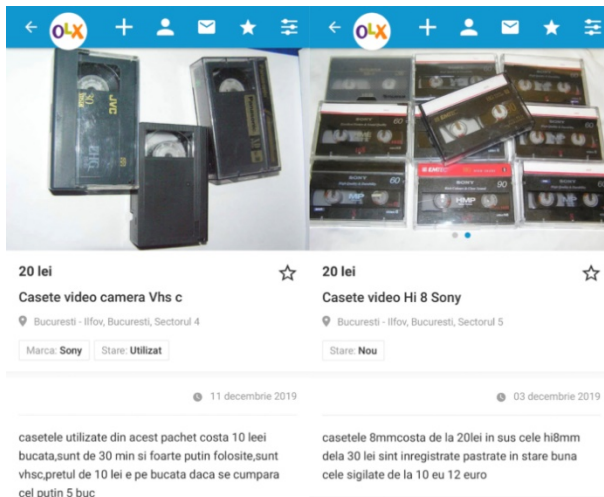
Fig. 5: Classified for Hi-8 tapes on the Romanian e-commerce platform OLX, mentioning their price, brand, and length.

in the online ad, and a large number of the sellers do not know the content of the tapes. What they do know is the social trajectory of their merchandise, the place where the tape was purchased and the conditions under which it was stored. Usually, the only information about the recorded contents is limited to the few words written on the sleeves or the tapes themselves – when they are not erased by the seller, in order to give the object the newest possible appearance (Figures 5, 6).