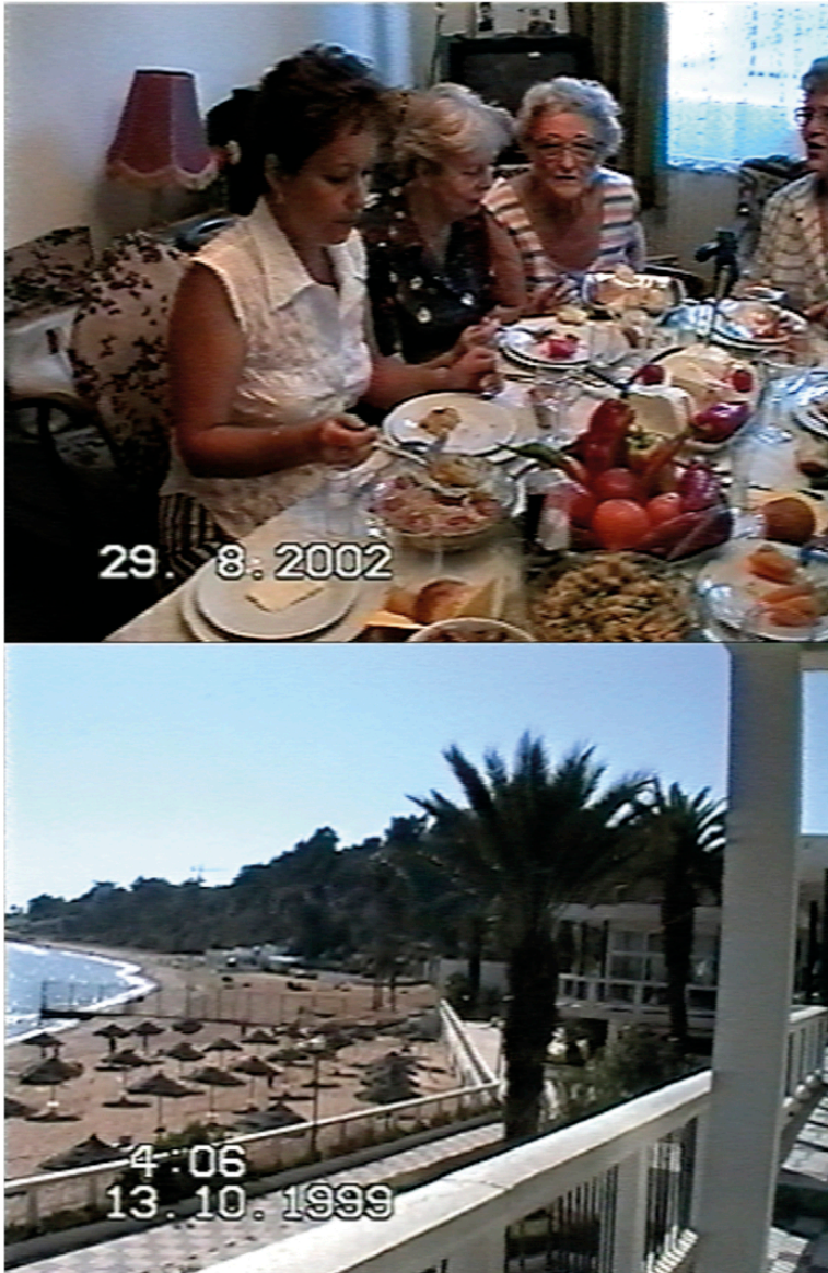
Fig. 8: Stills of a VHS-C video, showing different layers of recordings, in Romania in 2002 and Morocco in 1999.

the ordinary material culture of Romania over the past thirty years. The durability of these circulations for the productions of pirate videos or home movies, or for their resumption and resale on digital platforms, shows how much these different practices belong to the same media infrastructure.