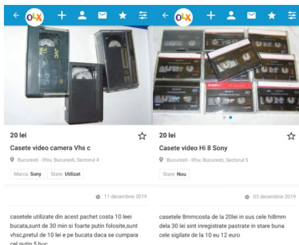
Fig. 5: Classified for Hi-8 tapes on the Romanian e-commerce platform OLX, mentioning their price, brand, and length.

in the online ad, and a large number of the sellers do not know the content of the tapes. What they do know is the social trajectory of their merchandise, the place where the tape was purchased and the conditions under which it was stored. Usually, the only information about the recorded contents is limited to the few words written on the sleeves or the tapes themselves – when they are not erased by the seller, in order to give the object the newest possible appearance (Figures 5, 6).