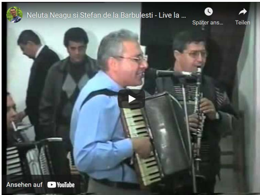
Fig. 3: Live at a wedding from Dițești, 1997.

This bifurcation of images, put into circulation according to a principle distinct from their initial use by collectors and YouTube users, can also be observed on other digital platforms. The tapes are not digitised; this time they are put on sale on e-commerce platforms, notably Olx and Okazii, the most used in Romania. Diverse documentary and educational films, or even home movies shot on celluloid (Super 8, 8mm, 16mm), are for sale on these platforms. Even if the precise content of the film is not described by the seller (some of them do not have a film projector), the monetary value of the film is always indexed to the rarity of the presumed content filmed or photographed, in addition to the metric length of the film. Thus, Robert,[22] one of my contacts, a film enthusiast and collector, is able to precisely describe the entire film collection that he has built up over the years by frequenting flea markets ( piețe de vechituri ) in Bucharest (such as Târgul Valea Cascadelor[23] [Figure 4]). It was notably through these channels that he bought a large stock of 16mm copies of educational films produced by Alexandru Sahia Studios under the communist regime in Romania, films that were sold at a discount in the 1990s as the factories where they were shown and stored closed.[24]