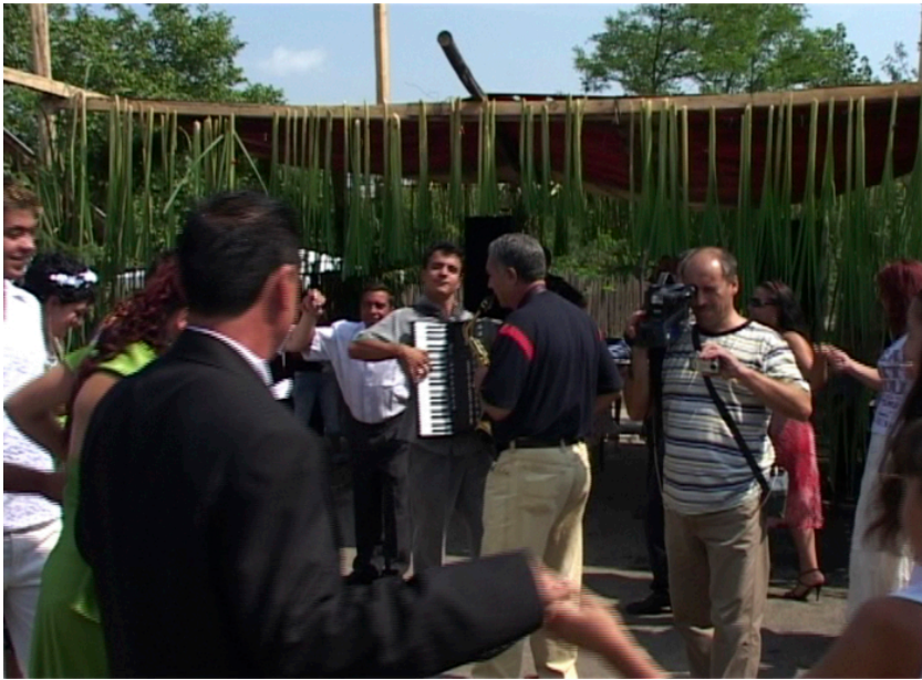
Fig. 2: The cameraman in the middle of the hora.

and ethnographic film. All commissioned home movies are thus marked by an overabundance of instructions to guide the cameraman's work. When I ventured to shoot the crowd, the children standing silently watching on the side-lines of the party – in order to have the wider context of the action being filmed –, my clients immediately pulled me aside and asked me to stop. They were motivated by the desire to spare the recording of these images from impoverishment and ethnic markers – the Gypsy Hood refers both in the eyes of my interlocutors and their gagi or români (non-Roma) neighbours to the representation of an ethnic and social enclave from which one must distinguish oneself at all costs .