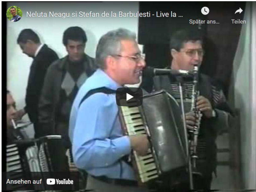
Fig. 3: Live at a wedding from Dițești, 1997.

This bifurcation of images, put into circulation according to a principle distinct from their initial use by collectors and YouTube users, can also be observed on other digital platforms. The tapes are not digitised; this time they are put on sale on e-commerce platforms, notably Olx and Okazii, the most used in Romania. Diverse documentary and educational films, or even home movies shot on celluloid (Super 8, 8mm, 16mm), are for sale on these platforms. Even if the precise content of the film is not described by the seller (some of them do not have a film projector), the monetary value of the film is always indexed to the rarity of the presumed content filmed or photographed, in addition to the metric length of the film. Thus, Robert,[22] one of my contacts, a film enthusiast and collector, is able to precisely describe the entire film collection that he has built up over the years by frequenting flea markets ( piețe de vechituri ) in Bucharest (such as Târgul Valea Cascadelor[23] [Figure 4]). It was notably through these channels that he bought a large stock of 16mm copies of educational films produced by Alexandru Sahia Studios under the communist regime in Romania, films that were sold at a discount in the 1990s as the factories where they were shown and stored closed.[24]