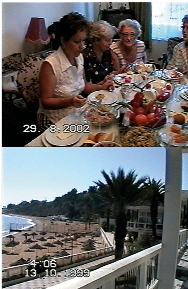
Fig. 8: Stills of a VHS-C video, showing different layers of recordings, in Romania in 2002 and Morocco in 1999.

the ordinary material culture of Romania over the past thirty years. The durability of these circulations for the productions of pirate videos or home movies, or for their resumption and resale on digital platforms, shows how much these different practices belong to the same media infrastructure.