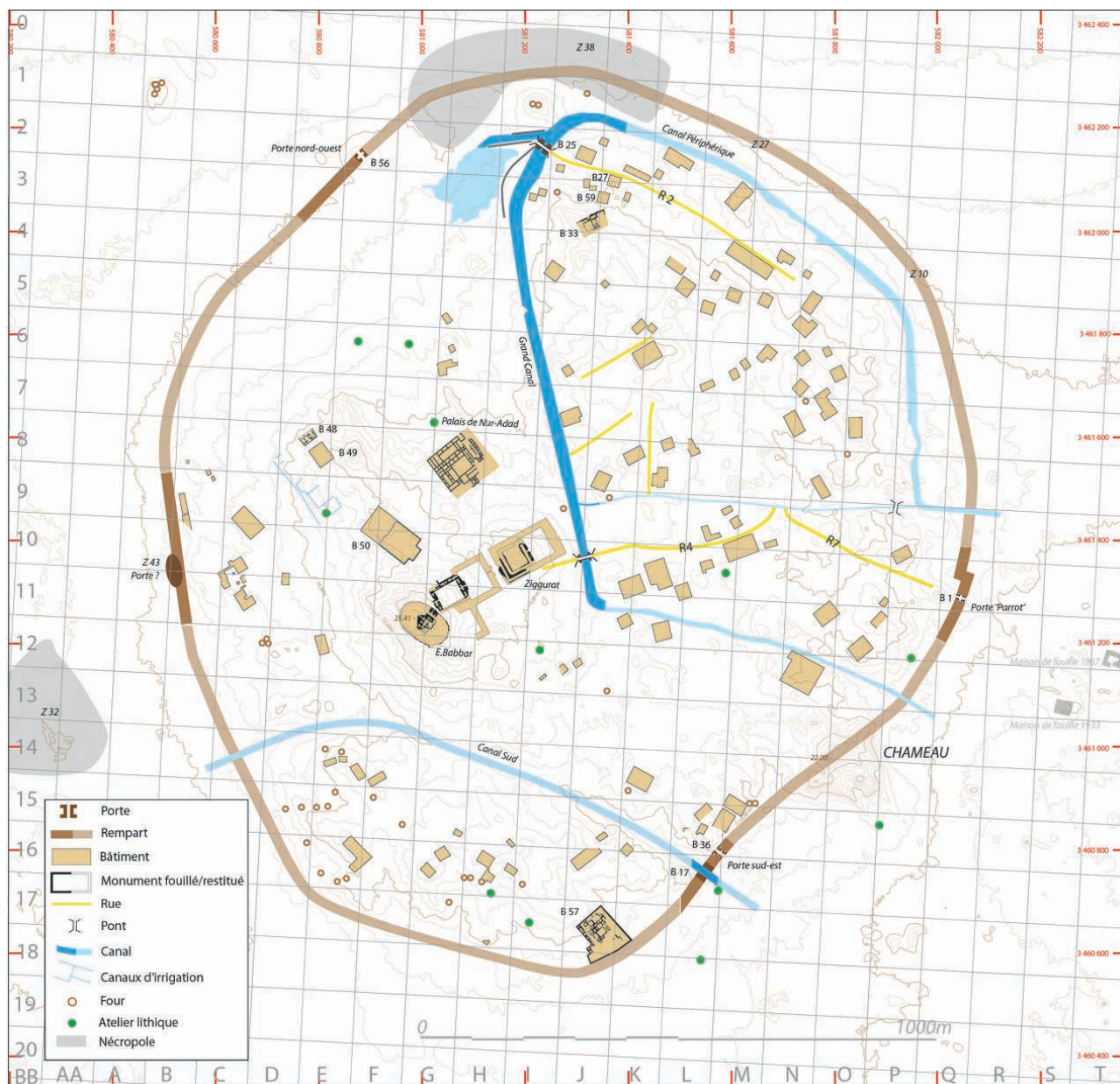
Figure 3. Plan of Larsa after the 2019 campaigns (Vallet, 2020).