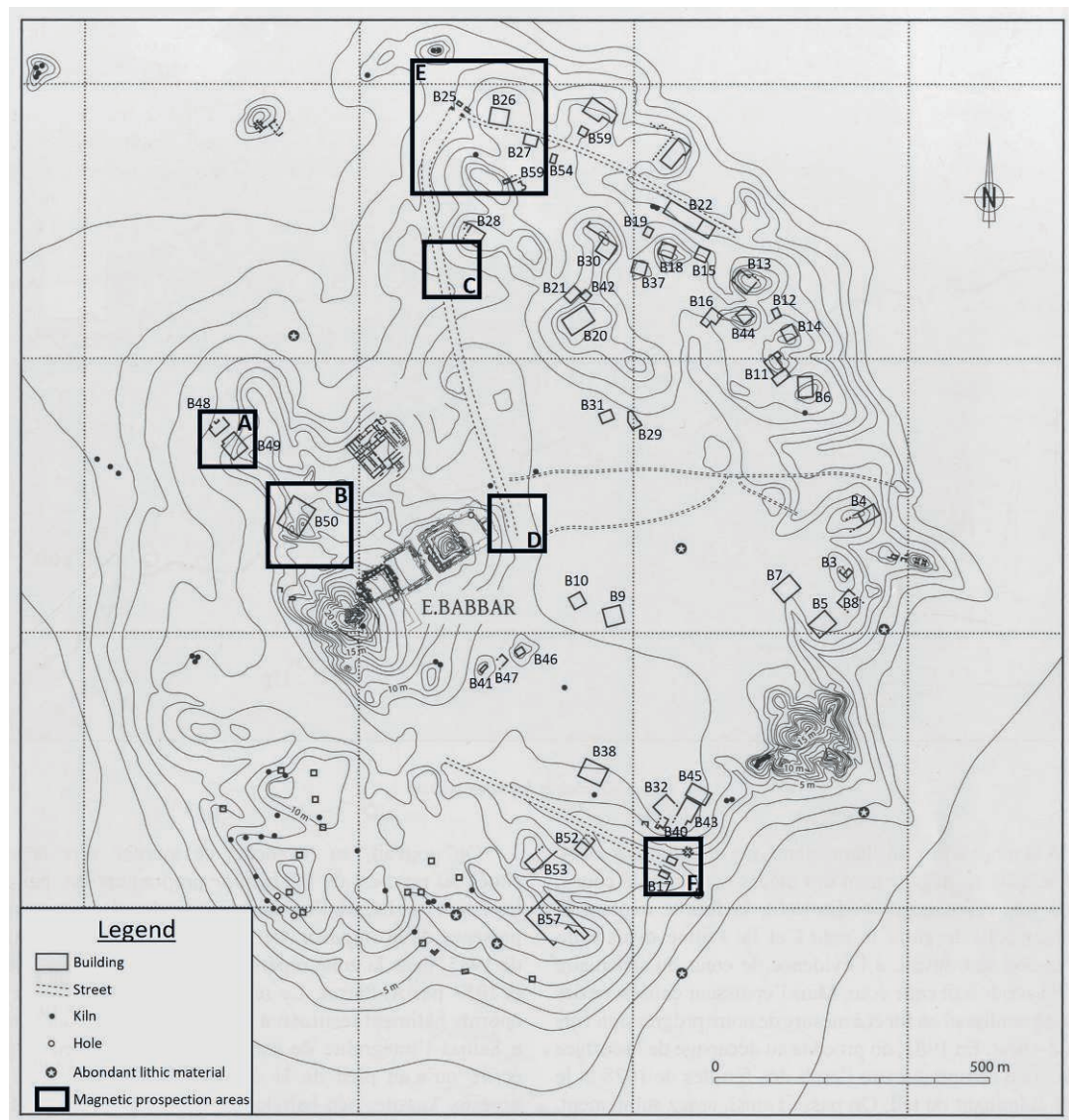
Figure 1. Plan of Larsa before the 2019 campaigns (Huot, 2014).

Magnetic prospecting was carried out with a caesium vapour gradiometer G858 (Geometrics Inc.) with a grid of 1\text{ m} \times 0.10\text{ m} interpolated at 0.50\text{ m} . The results were processed with WuMapPy open-source software (Marty et al. , 2015), and overlaid on an aerial drone view (Fig. 2).