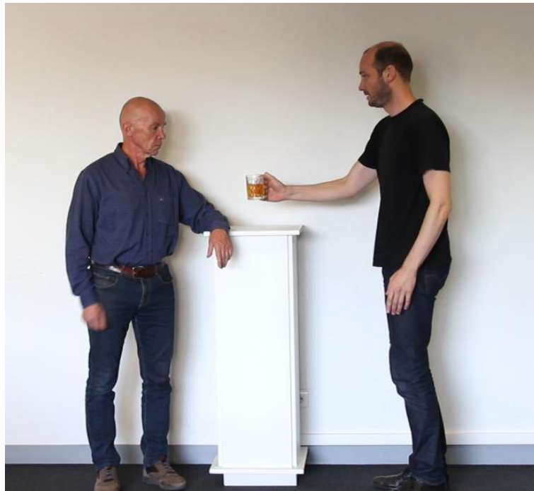
Figure 4. Illustration of the short film used in Experiment 5 and adapted from the comic strip used in Experiments 1-4.

We used short (1 minute) movies in which two male actors (one professional and one semi-professional) played either the role of dominant character or that subordinate character (see Figure 4. for an illustration). The spatial location (left vs. right) of the actors and the roles they were attributed (dominant vs. subordinate) were counterbalanced, resulting in 4 short movies. The scenario and dialogues were identical to those of the comic strips used in Experiments 1-4 (see Figure 1 for the script). Each participant viewed a single movie.