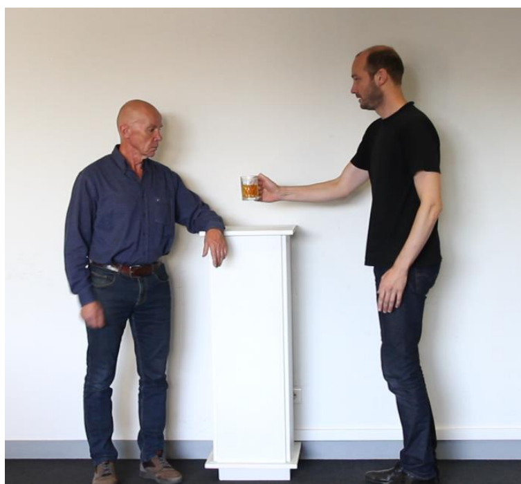
Figure 4. Illustration of the short film used in Experiment 5 and adapted from the comic strip used in Experiments 1-4.

We used short (1 minute) movies in which two male actors (one professional and one semi-professional) played either the role of dominant character or that subordinate character (see Figure 4. for an illustration). The spatial location (left vs. right) of the actors and the roles they were attributed (dominant vs. subordinate) were counterbalanced, resulting in 4 short movies. The scenario and dialogues were identical to those of the comic strips used in Experiments 1-4 (see Figure 1 for the script). Each participant viewed a single movie.