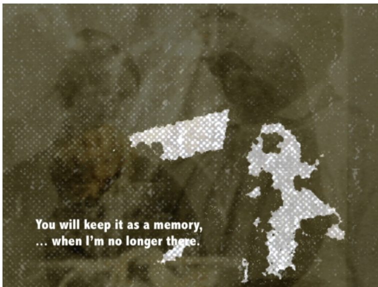
Fig. 4: Photogram of RM#1 (2016).

Instead of 'degradation' we propose the ideas of autonomisation and 'textility': the 'dead' pixels are actually pixels whose colour value is independent of the entire image. However, we encountered difficulties in arranging this digital material with the images filmed in MiniDV. Our multiple attempts only led us at first to a vulgar superposition of pixelated evolutions and filmed sequences of the birthday, or to a total dissolution of one in the others (Fig. 3). We made the link then through another corpus, which we already wanted to address: judicial photographs by Carl Durheim on 'Stateless People and Travellers' ( die Heimatlose und Fahrende ), in the canton of Bern in 1852.[xx] From a plastic point of view, the chromatic or sonic aberrations of the MiniDV and the grains of the digitised salt paper of the Durheim photos are progressively part of the same project. The graft is immediate, the salted paper and the digital material form a single organic material.