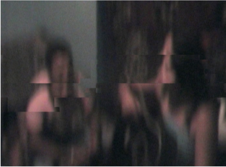
Fig. 2: DV Amintire #5 (Dițești. Summer 2009, Ethnographic Archive).