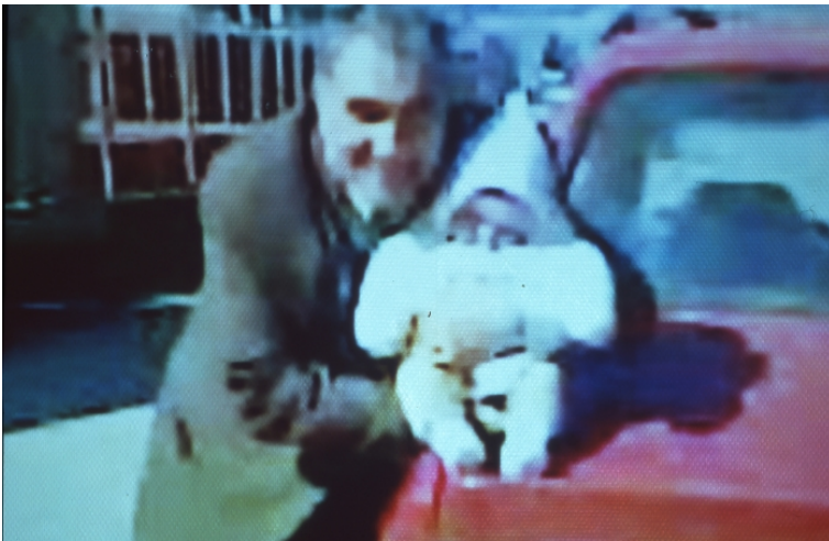
Fig. 8: A digitised slide from the installation RM#2 (2017).

voluntarily reverse the values currently associated with high and low resolution in digital archives, i.e. the heritage value of the national archives, and the authenticity of low-res amateur images. Thus, in RM#2 , the compressed images of mobile phones are projected on a white wall lined with fiberglass and rephotographed with a still motion camera, loaded with a positive film. Image by image, these souvenir images are re-recorded so that the grain of the fiberglass is superimposed on the texture of the digital image. Projected through a slide carousel as one of the five screens of the RM#2 installation, these images appear with a new texture – an almost pictorial grain. From this point of view, our practice echoes Giovanna Fossati's observations on how 'practice is in a constant state of transition, characterized by a growing hybridization between analog and digital technology'.[xxv]