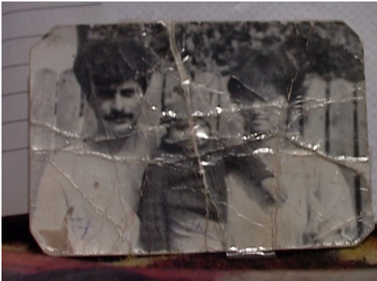
Fig. 6: A silver photograph from D.

The strange familiarity – because a priori opposed – between the digital noise and the grain of the salted paper concretises one of the first hypotheses emitted to define the horizon of our intervention. The material produced by the grafting of these different digital materials comes unexpectedly close to the specific aspect of the silver photographs of the families of the village of Dițești – that are drawn on cardboard and pinned on the walls of the ‘family home’ ( casa bătrânească ), or crumpled, stained, and literally decomposed by their piling in the drawers, or digitally rephotographed and published on Facebook (Fig. 6). Cropping, pen marks, folds, spots, the materiality of these family photographs corresponds with the erasure or retouches in pencil brought to Durheim’s photographs, occasions that, in several places, come to highlight or resume a facial feature or a line of clothing (Fig. 7).