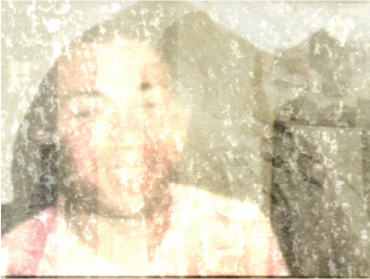
Fig. 5: Photogram of RM#1 (2016).

If the graft takes as well (Figs 4 & 5), it is because the judicial photographs are not left as they are. Digitised at very high resolution (4800 dpi), they exceed by far the resolution of the images from the MiniDV. Our choice here, guided also by the desire to subvert the primary role of these photographs – identification[xxi] – is not to resize these images, but to let them overflow from the image. Therefore, we transform the very high resolution in a cutting factor. Each photograph is thus fragmented into a set of pieces – a piece of salted paper, where a hand, a part of a face, fabric, or simply the material of the digitised salted paper appears. Again, the image is texture before becoming a figure. Fragmented clichés are thus transformed into a digital material, from which fragmentary details of judicial photographs and movements of the video sequence of the MiniDV arise. The ‘textility’ of these proliferating images produced by a constant back-and-forth between high and low resolution, between recorded images and exogenous digital material, finally blurs the lines ordinarily drawn between matter and the figures presented in the image. On the other hand, the work of the collective consists in opening up possibilities to produce levels of readability, which give the same attention to these two elements.