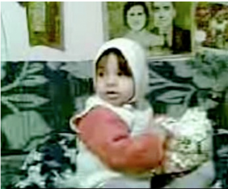
Fig. 1: Home movies shot with a first generation mobile phone in Dițești, 2008.

all the equipment they required (cassettes, cables, computers), and the first smartphones were just emerging (Fig. 1). Without proper storage media, these images disappeared most often after a few months. The phones were exchanged and DVDs, delivered without plastic cases, were viewable for a few months at most. The imperfections in digital media were such that Larcher's interlocutors regularly entrusted him with the task of keeping and copying the videos of family celebrations that they had recorded elsewhere. Today, all these first domestic digital videos, filmed in extremely low resolution, have disappeared.