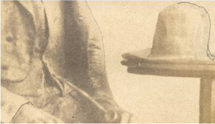
Fig. 7: Fragment of Anton Appell portrait. Photography by Carl Durheim (1852).