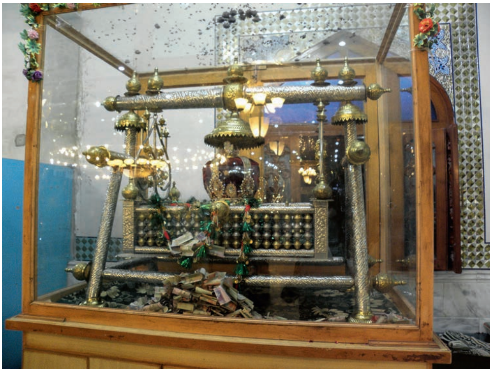
FIGURE 4 ʿAlī Asghar's jhūlo in Qadamgāh Imām ʿAlī, Hyderabad

shall see below, many processions work as connections between the Qadamgāh Imām ʿAlī and the Karbala of Hyderabad, called Karbala Dadan Shah.