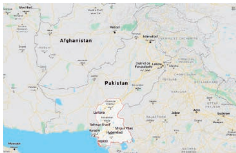
FIGURE 2 Sindh with main cities and places

“New Day” is an important festival among the Muslims of South Asia, for both Sunnis and Shi‘ites. In Persia, it was a celebration of the renewal of nature and the coming of Spring. In Qajar Persia (1779–1925), the shāh received guests consisting of kinsmen, military and civil officials, leading religious figures, tribal chiefs, poets, heads of various guilds, and, increasingly, foreign notables. The same protocol was possibly adopted by the Tālpūrs in Sindh. Furthermore, the transportation of the Mowlā jā Qadam to the Tālpūr capital can be given a strong political meaning. From early on in the history of the Muslim world, sacred relics were seen as a determining factor in the process of legitimizing a new political power (Meri, 2010).