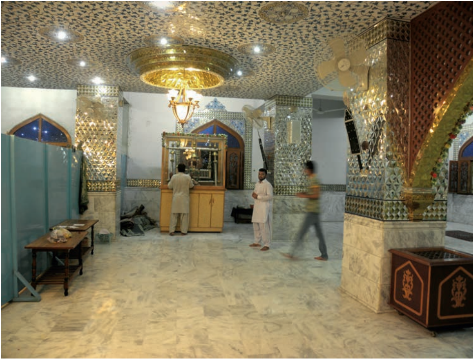
FIGURE 5 The main room, where many different devices related to the Imams are exhibited, Qadamgāh Imām ʿAlī, Hyderabad. On the left side, the palisade which separates men from women