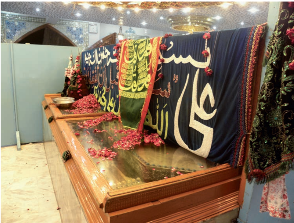
FIGURE 6 The footprints of ʿAlī in stone in Qadamgāh Imām ʿAlī, Hyderabad

the ritual varies and depends on the devotees. Once the vow is fulfilled, the devotees bring gifts or nazrānas to the Qadamgāh. They are of different types, and include sweets or flowers, but the best gift for spiritual benefits ( ṣawāb ) is an offering of niyāz , cooked food. 19