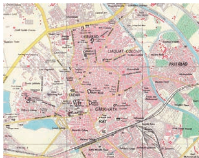
FIGURE 7.B Sketch Map of Hyderabad, Survey of Pakistan ↑North 2 cm = 500 m