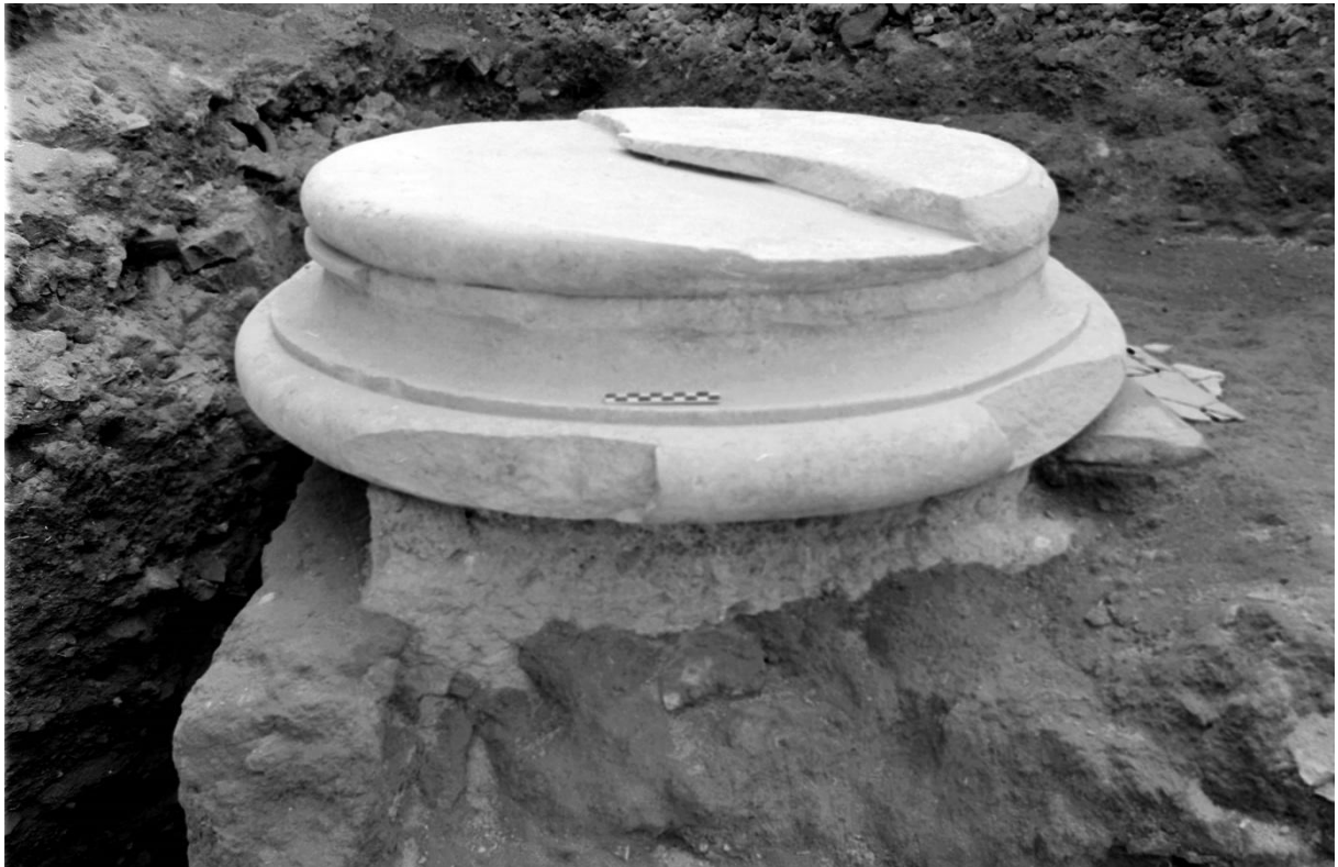
Figure 1. Peristyle column marble base of the Julio-Claudian domus. Photograph from Villedieu et al, 2001, Figure 14.