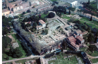
Fig. 1. Aerial photograph of the Vigna Barberini taken early 1999.