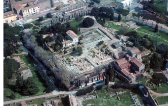
Fig. 1. Aerial photograph of the Vigna Barberini taken early 1999.