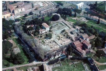
Fig. 1. Aerial photograph of the Vigna Barberini taken early 1999.