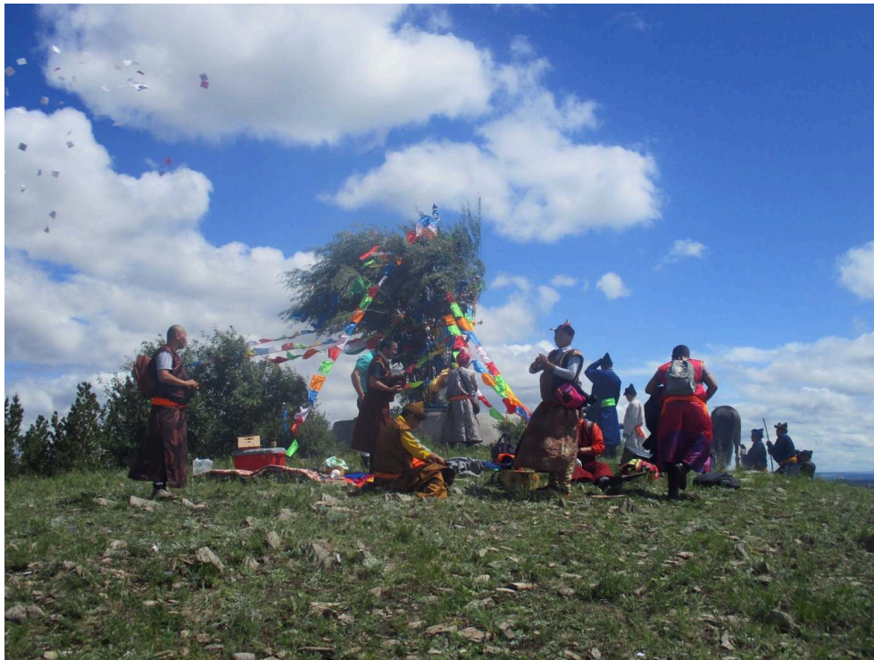
Figure 7. Buryat lama after reading prayers during Uitehen Ovoo ritual, Evenki Autonomous Banner, Hulun Buir, June 2019