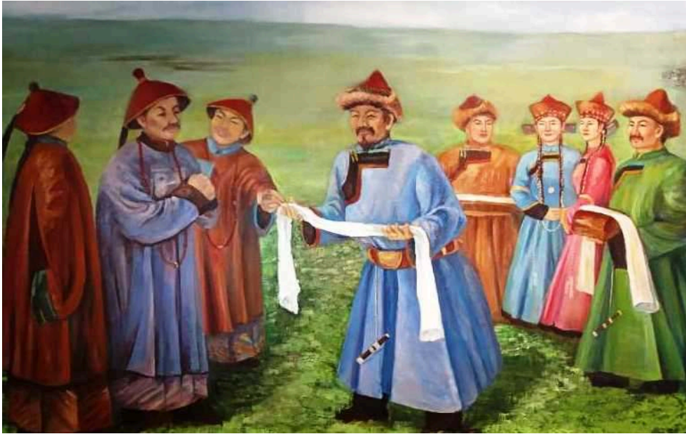
Figure 4. Oil painting representing the Buryats offering ceremonial scarfs ( hadag ) to Daur high officials during a naadam in the 1920s

Author and date unknown. Museum of Hulun Buir local court, Hailar, Hulun Buir