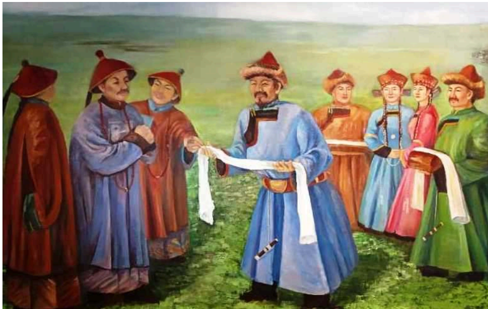
Figure 4. Oil painting representing the Buryats offering ceremonial scarfs ( hadag ) to Daur high officials during a naadam in the 1920s

Author and date unknown. Museum of Hulun Buir local court, Hailar, Hulun Buir