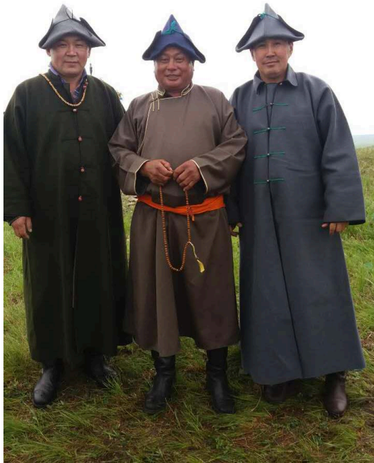
Figure 8. Buryat men after an ovoo ritual

Men on the left and right side wear the tshobo , a Buryat traditional clothe made of felt. The cone-shaped hat, also made of felt, is called a yodang , Evenki Autonomous Banner, Hulun Buir, June 2017