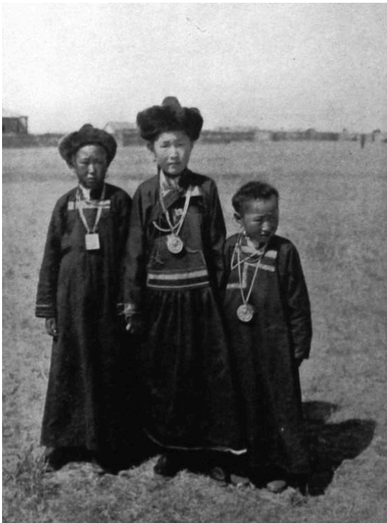
Figure 3. Young Buryats in Hulun Buir in the early 1930s