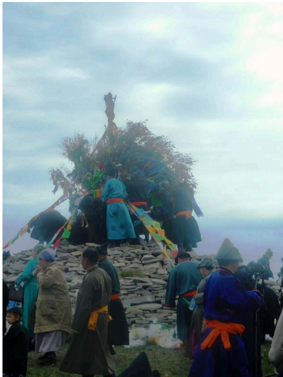
Figure 5. Worshippers are making offerings to Bayan Han Ovoo, Evenki Autonomous Banner, Hulun Buir, June 2017