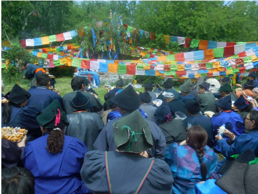
Figure 6. Worshippers are listening to lama's prayers during Erdeni Uul Ovoo ritual, Evenki Autonomous Banner, Hulun Buir, June 2018

offerings in their hands and make a circular movement, saying “ hurai hurai ”, which means “to reach, to collect [fortune]” 28 . When the ritual ends, people gather to share food at the bottom of the mountain where the naadam games will take place.