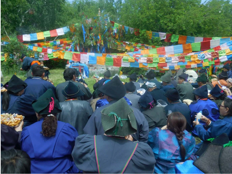
Figure 6. Worshippers are listening to lama's prayers during Erdeni Uul Ovoo ritual, Evenki Autonomous Banner, Hulun Buir, June 2018

offerings in their hands and make a circular movement, saying “ hurai hurai ”, which means “to reach, to collect [fortune]” 28 . When the ritual ends, people gather to share food at the bottom of the mountain where the naadam games will take place.