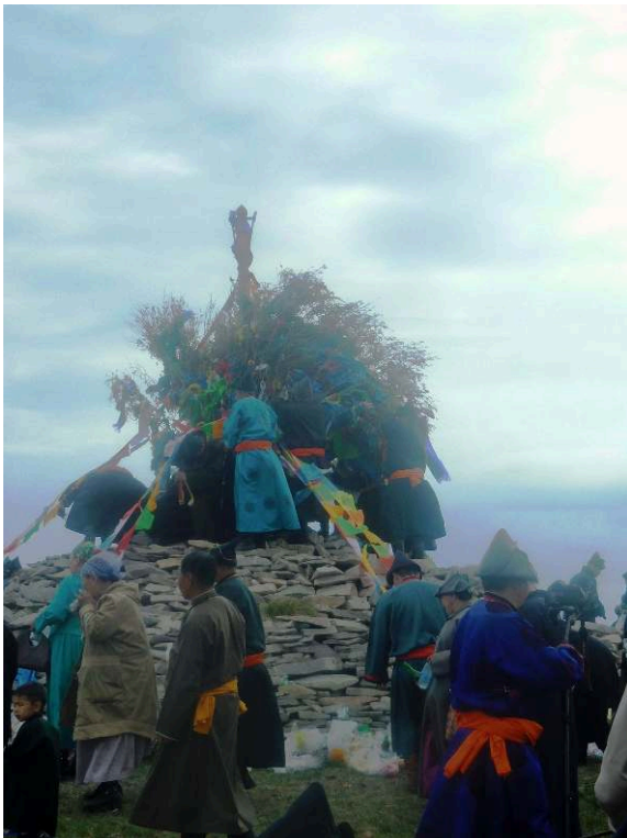
Figure 5. Worshippers are making offerings to Bayan Han Ovoo , Evenki Autonomous Banner, Hulun Buir, June 2017