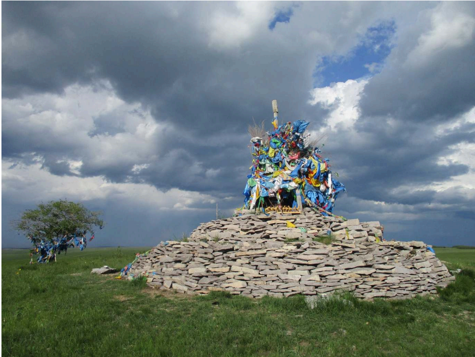
Figure 2. A view of the Bayan Han Ovoo before the annual worship ceremony, Evenki Autonomous Banner, Hulun Buir, June 2018